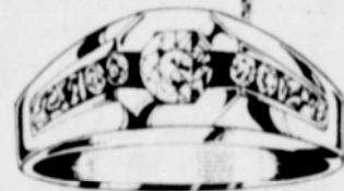
5-Diamond ring. $1,600