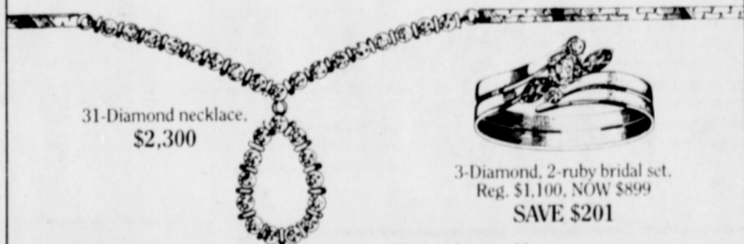
31-Diamond necklace. $2,300