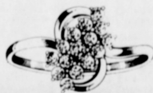
15-Diamond ring. $1,400