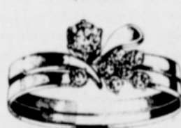
8-Diamond bridal set. $900