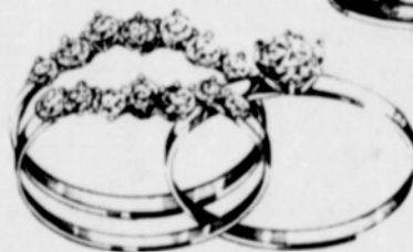
14-Diamond guard ring. $2,750