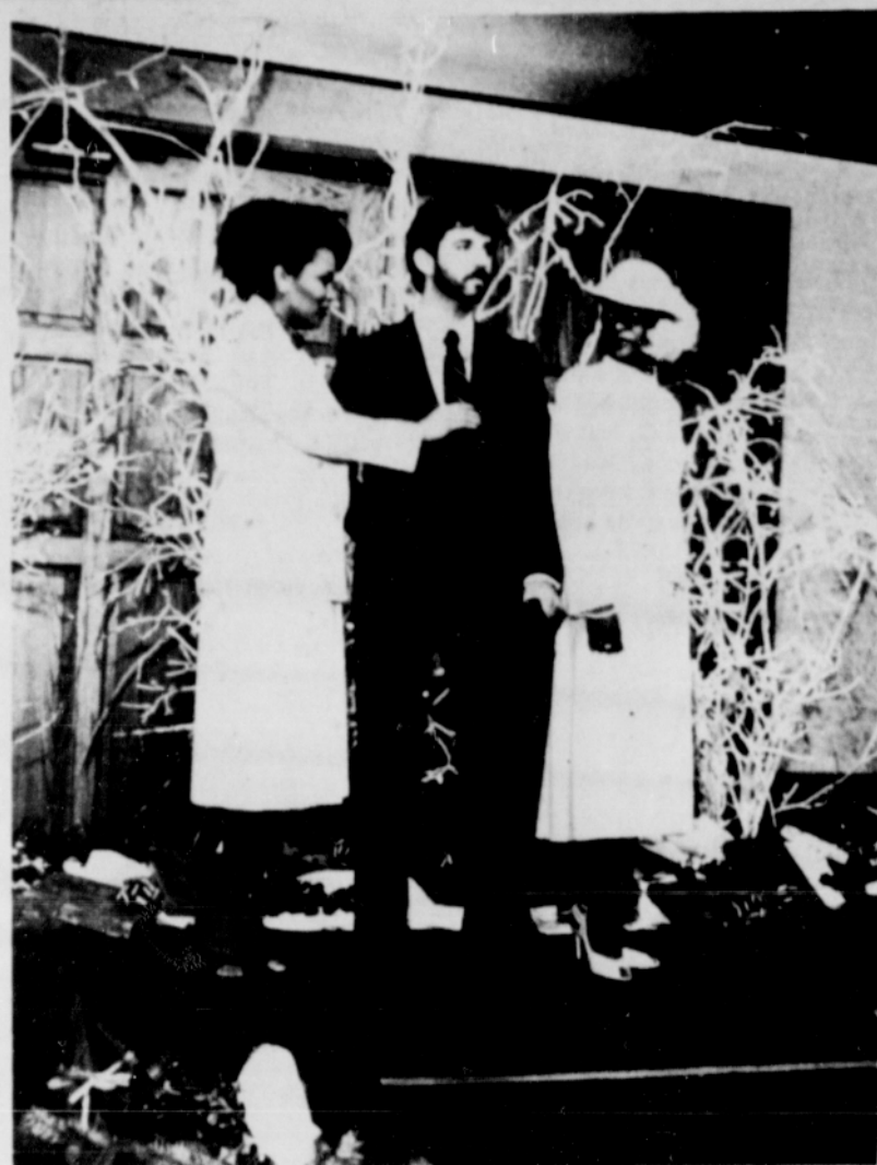
"The Portland Collection" was featured at the Jack and Jill of America, Inc., fashion show Sunday. The show will benefit the Stars and Stripes drill team.

Dinner and fashions made up an agenda for an enjoyable Sunday afternoon when the Portland Chapter of Jack and Jill of America, Inc. presented "The Portland Collection" to some 300 persons on December 5.