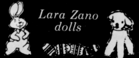
Lara Zano dolls

INVITES YOU TO COME AND SEE Charming XMAS GIFTS