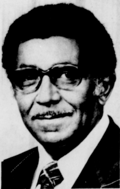
DR. JOSEPH LOWERY

"Lear's comedies are credited with the re-birth of the old minstrel characters: the shuffling Uncle Toms, the rascally picaninies, the fat mummies and the dim-witted coons. Instead of the old names like Buckwheat, Amos, Andy, Sapphire, Kingfish and Stepin Fetchit, Norman Lear's 'social satire' produced names like J.J. Sanford, Aunt Es-