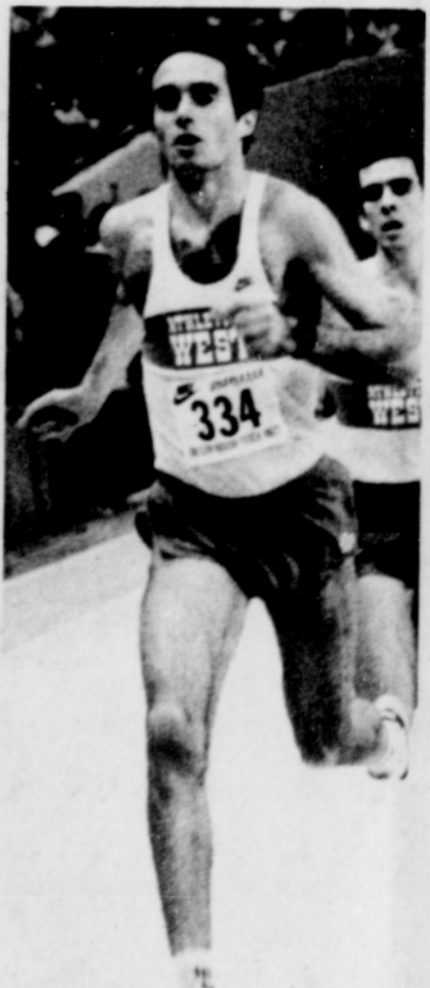
Alberto Salazar, formerly of the University of Oregon, won his third consecutive New York City Marathon in 2:09.29. He outran Rodolfo Gomez of Mexico by 4 seconds. Salazar is pictured above at the Oregon Indoor Invitational.