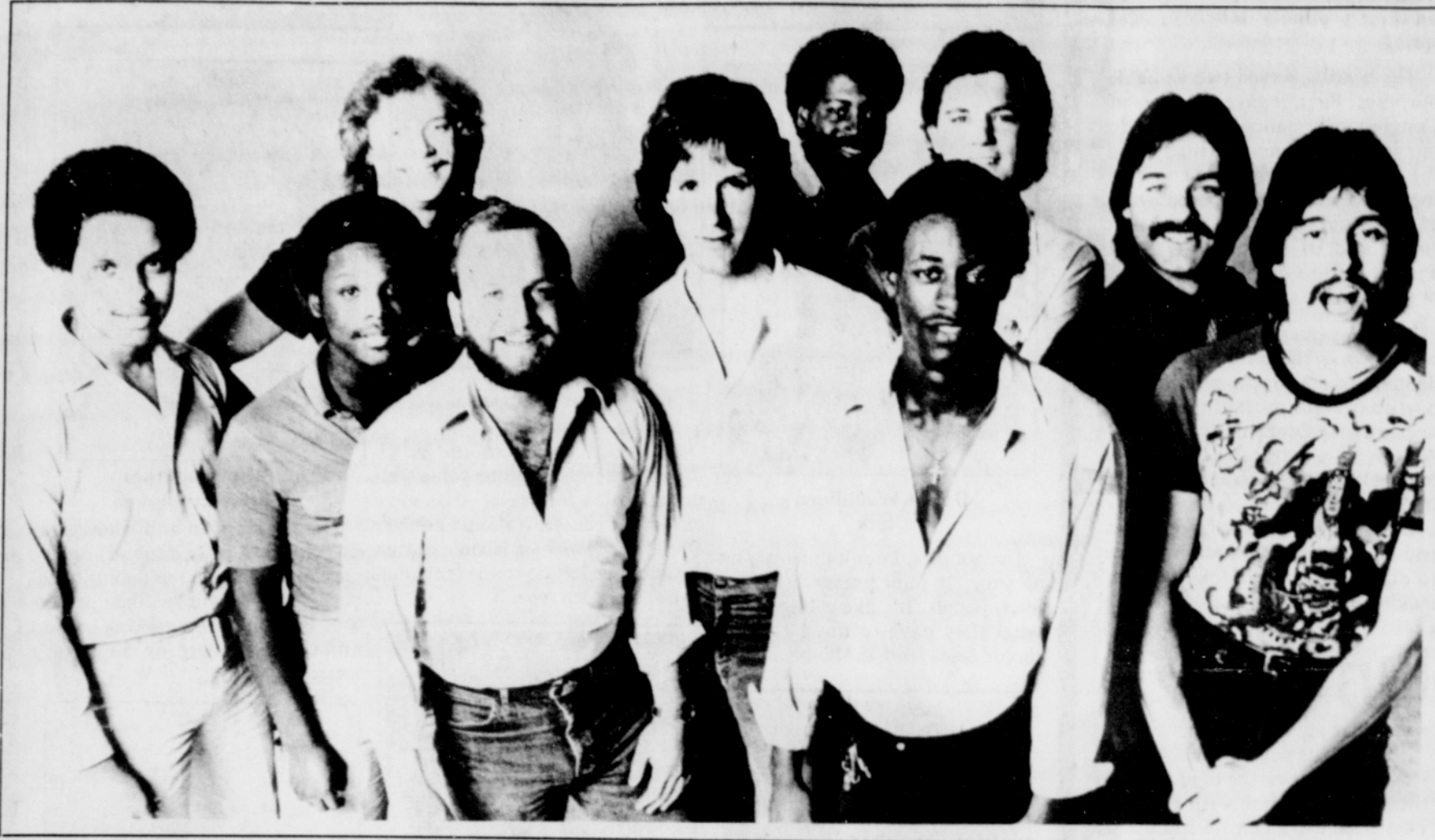
SHOCK will be at the Euphoria Wednesday, October 6, 1982, at 7:00 & 10:30. Tickets $6.00. Don't miss this great show at 320 S.E. 2nd.