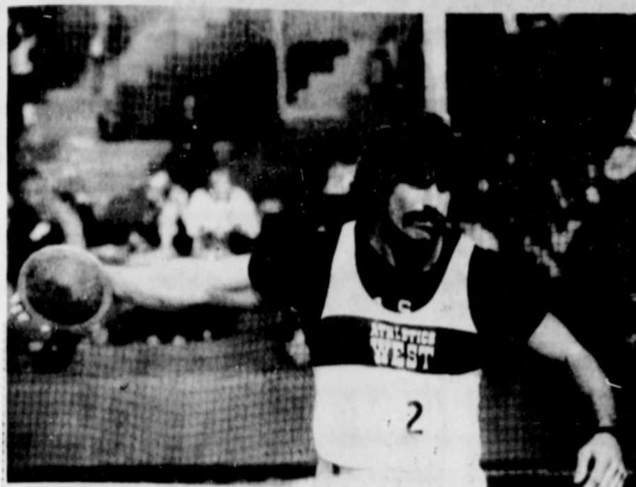
Mac Wilkins, gold medalist in 1976 Olympics, was second in discus behind John Powell. Powell's best was 211-7.