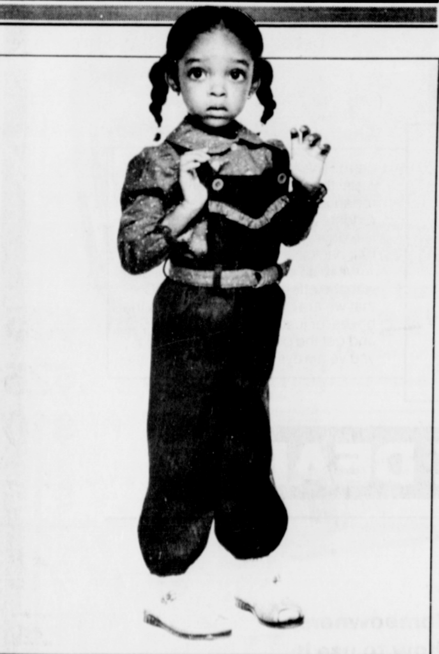
Snappy, sweet and sassy! That's the happy partnership of brushed denim and calico for summer wear. The overalls are newly styled with elasticized jogging bottoms and trimmed on bib and belt with the coordinated calico to match the peter-pan collared blouse. Something to boast about and feel good in, are these happy go-togethers that have the built-in quality of always looking neat and orderly, no matter how hard the wear and tear.