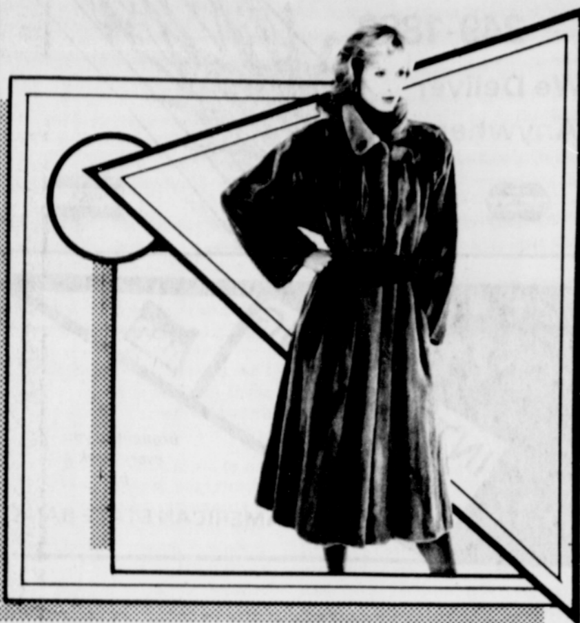
Shear Delight —Chloe's sheared Pastel Mink coat features Fall's most fashionable details: deep-set sleeves, a horizontally-worked yoke, and Chloe's unique spiral collar.