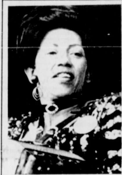
Queen Ida and the Bon Temps Zydeco Band will perform on Saturday night, October 2, at the Neighbors of Woodcraft, 1410 S.W. Morrison, at 7 pm. Tickets are $6, available from Meier & Frank, Stevens & Sons, Everybody's Records and Music Millennium or at the door.

Like many of our finest Blues and Jazz artists, Queen Ida is a well-established performer in Europe who is just now being discovered by American audiences. The band is led by Queen Ida on lead vocals and button accordion—an instrument imported by Bavarian immigrants who settled in Southwest Louisiana in the 1880s. She is backed up by fiddle, triangle, and guitar characteristic of the two-century-old French Cajun tradition. Washboard, bass, and drums add the Afro-American Blues element which propels the music into the latter half of the 20th century.