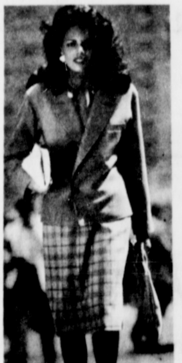
This goldenrod/rust skirt and matching rust jacket make a stunning combination in wool.