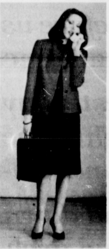
Belted, long-sleeved, black daytime dress is crisply topped by a striped jacket with a mandarin collar.