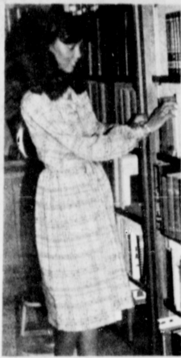
Easy morning dress; just pops over the head and can be nipped in with its own self-fabric wide belt. Dress it up or down with scarves or jewelry.