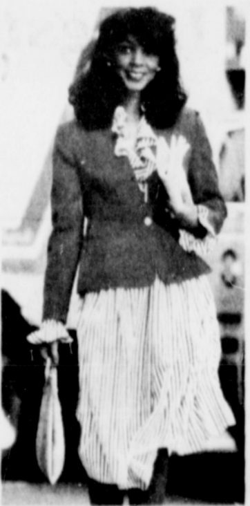
A claret/teal wool skirt of sunburst pleats offsets a claret crinkles crepe-de-chine blouse with a ruffled collar. The jet velveteen fitted jacket shapes the outfit.