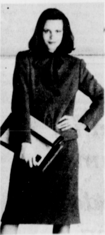
Classic proportions, impeccable tailoring—and a stock-tie charcoal crepe-de-chine blouse—will take you and your terracotta/gray tweed suit through years of business wear. The jacket is lined to match the blouse.