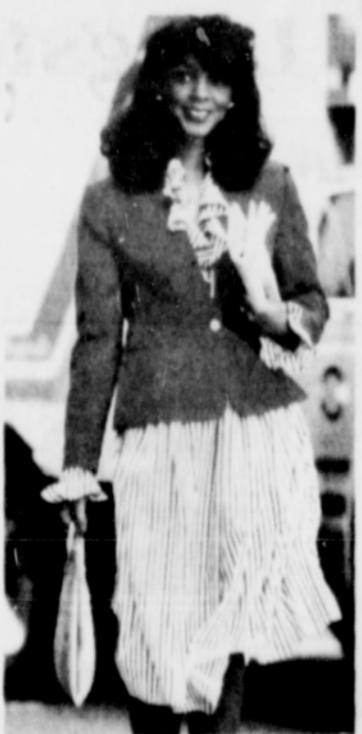
A claret/teal wool skirt of sunburst pleats offsets a claret crinkles crepe-de-chine blouse with a ruffled collar. The jet velveteen fitted jacket shapes the outfit.