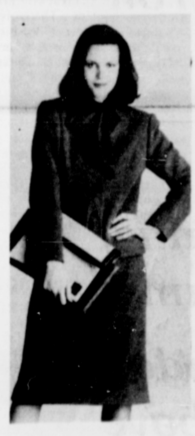
Classic proportions, impeccable tailoring—and a stock-tie charcoal crepe-de-chine blouse—will take you and your terracotta/gray tweed suit through years of business wear. The jacket is lined to match the blouse.