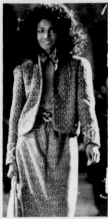
This slim skirt in basket-weave tweed, in multi-colors of teal, raspberry and cream.