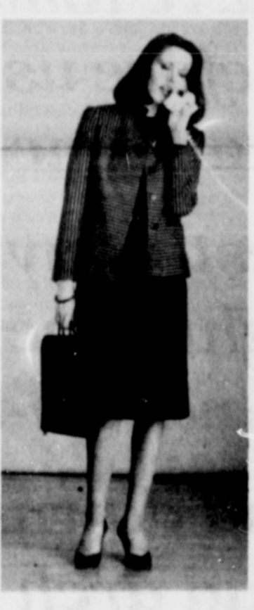
Belted, long-sleeved, black daytime dress is crisply topped by a striped jacket with a mandarin collar.