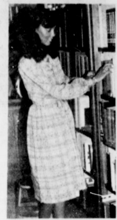
Easy morning dress; just pops over the head and can be nipped in with its own self-fabric wide belt. Dress it up or doen with scarves or jewelry.