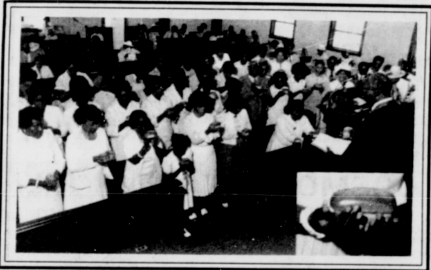
Parishioners of the Allen Temple CME Church give "Love Loaves" to help the hungry.

•Clean floors, woodwork and furniture with cloths and mops moistened with water or mineral oil.