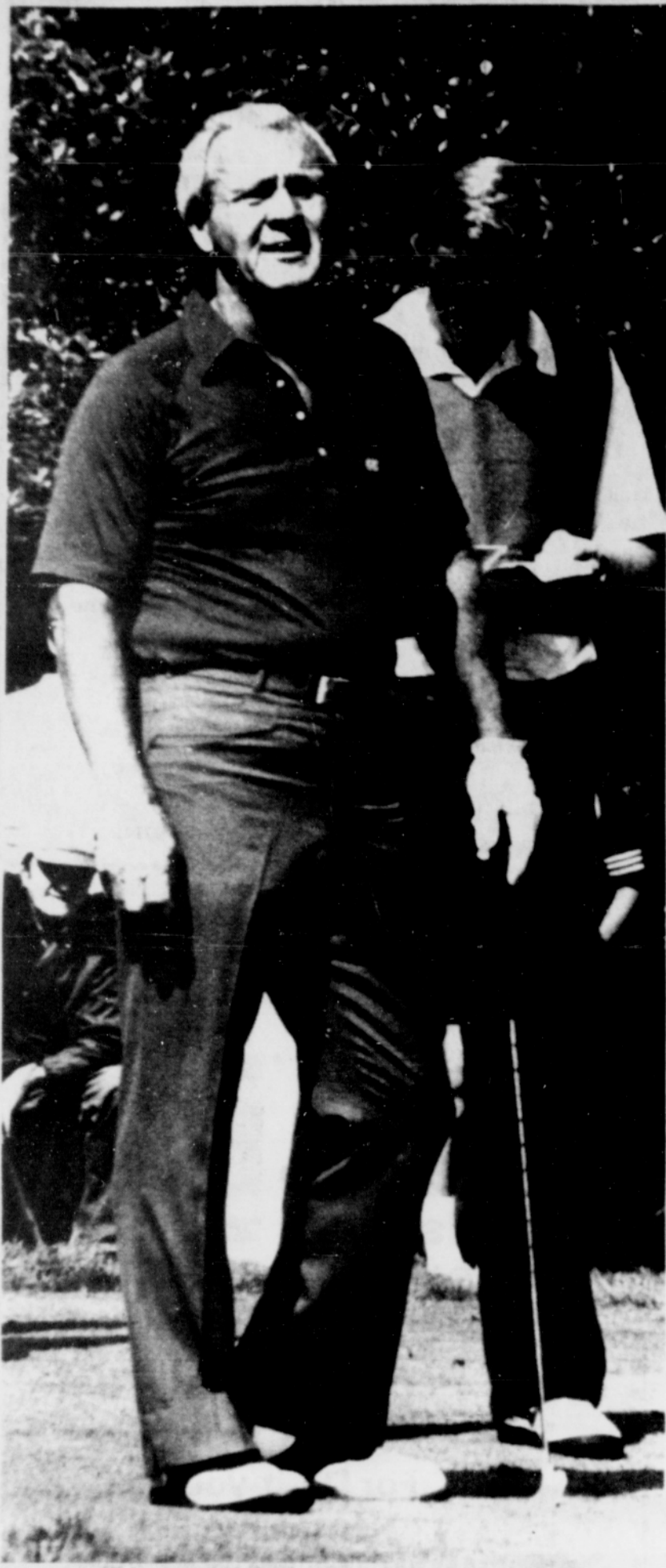
The third U.S. Senior Open Championships were held in Portland last week with many of the senior stars participating. Arnold Palmer, the crowd favorite, (above), finished third.