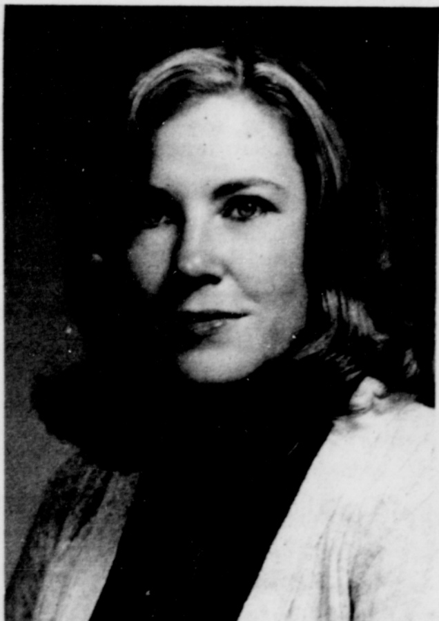
Rep. Gretchen Kafoury "State Government"