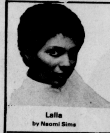
Lalla by Naomi Sims