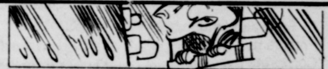
According to folklore, if you eat a grape, it means that it will surely rain the next day.

MRS. C's WIGS 707 N.E. Fremont 281-6525 Closed Sun. & Mon. OPEN Tues. thru Sat. 11:30 AM to 6:00 PM