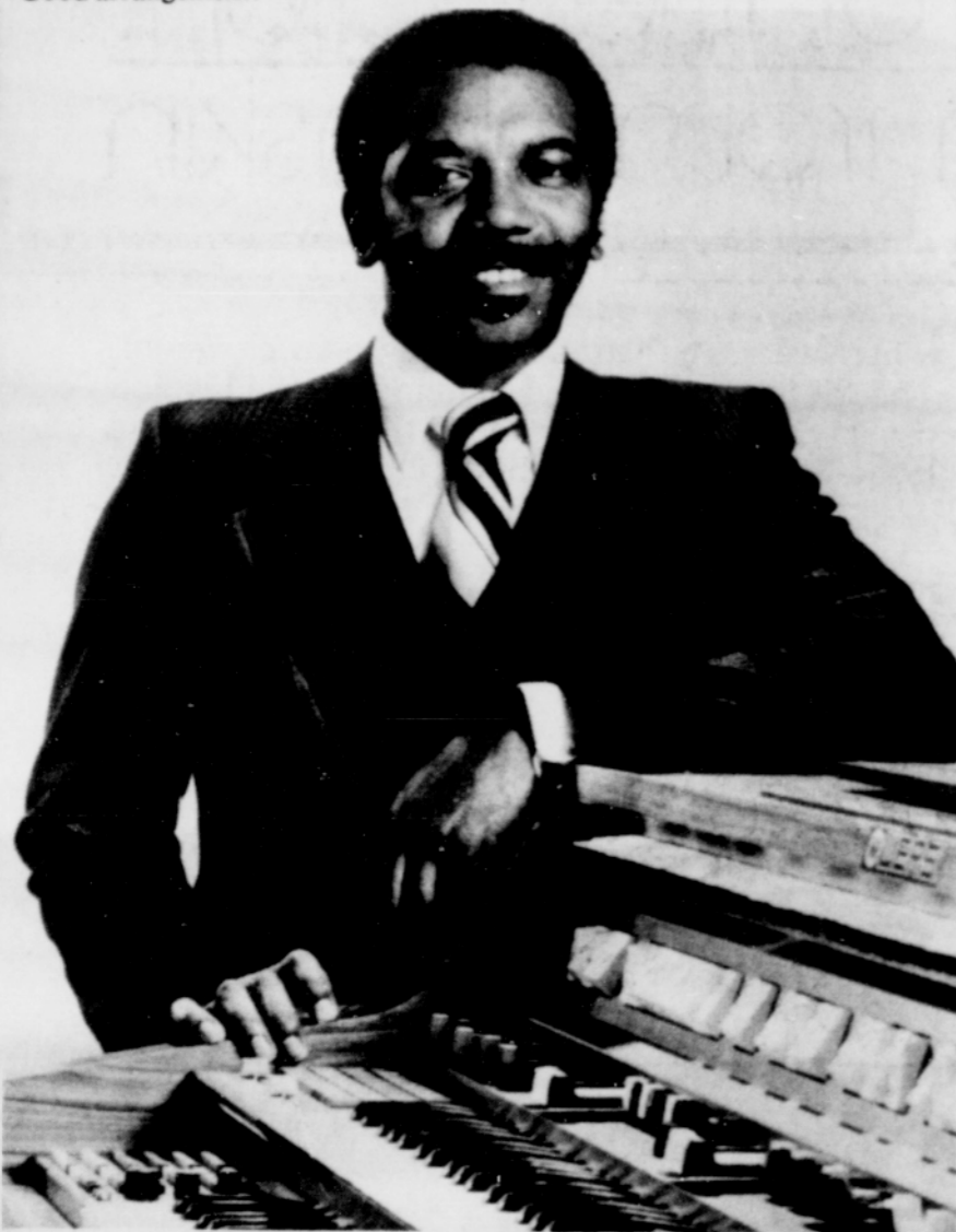
Jimmy Smith, world's finest jazz organist, will be appearing at Geneva's Lounge, 4228 N. Williams Ave., on Monday, June 14 and Tuesday, June 15. There will be two shows nightly at 8:30 and 10:30 p.m. Tickets are $7.00 and can be purchased in advance at Meier & Frank, Stevens & Son, Frederick & Nelsons and Music Millenium.

"It's A Sin To Tell A Lie." The chore of playing the melody is split on this song that has been around for a long time. First the tenor sax plays a phrase, Jimmy plays the next one, then they play the third phrase together. Good arrangement.