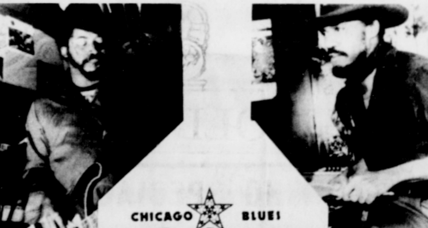
FREDDIE DIXON JIMMY TILLMAN

Come and join us for a most memorable evening with one of the greatest comedians of our time. Tickets are $19.95 and $12.75. For more information, please call 226-0034.