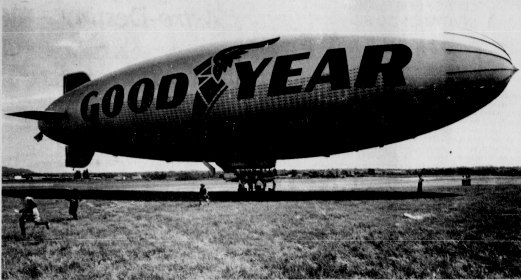
The happy students leave the Goodyear blimp following a ride over Northeast Portland.