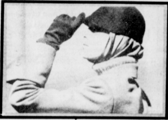
Riding hat by Perry Ellis

Your season's accessory purchases should be in tune to the colors of black, brown, beige and burgundy. Simplicity and elegance are the keys to your purchase. Newer hat design fashion concepts are the riding cap, the black ringmaster top hat and the gauchó—complete with long feather. Remember, its only a fashion trend for today's market—but in keeping with the inspiration of looking and feeling good.