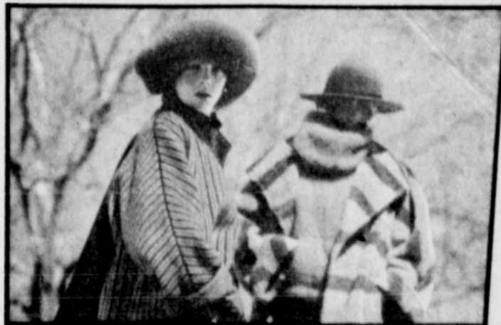
The wide brimmed bowlers at Oscar de la Renta

American designers are basic in form but use extravagant materials, such as luxurious furs, to create the style of the wide-brimmer and bowlers. To Portlanders, I'm saying, add a bit of spice and a key important accessory for fall and winter—purchase that one beautiful hat and place your attitude accordingly.