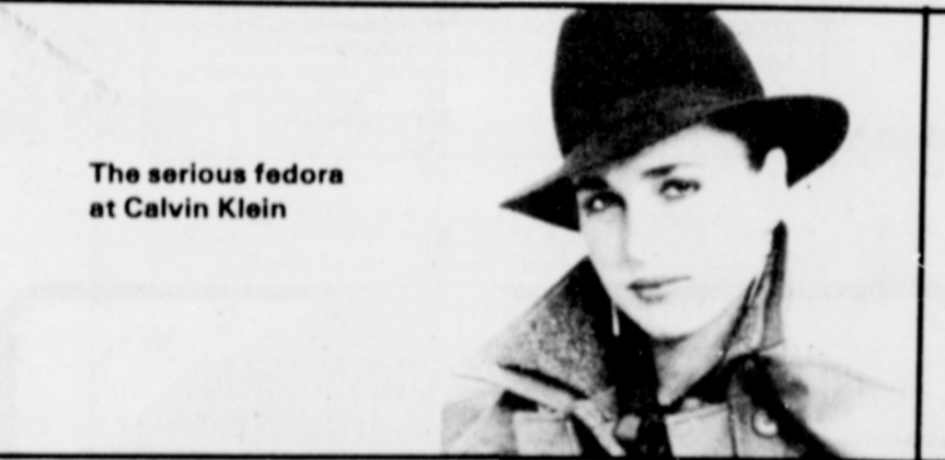
The serious fedora at Calvin Klein

The fashion conspiracy of hats has created a look of the past, bringing back the gangster look from head to toe. "The Dandies" are fashionably created and inspired by movies such as Victor/Victoria and Chariots of Fire ; the street attire of London or costumes from Guys and Dolls , the hit musical in London. The Dandies dress it up with their bow ties and bibbed shirts; dressed up brigade of vested Wall Street captains; rakish tuxedos and waif-like poor boys. It's all topped off with our Chicago gang look of the 40's. Black it is—with white remaining faithfully by. This fashion influence will be strong into the fall and winter. Men's wear look will be dominant, however, the feminine air will remain with ruffled blouses, curly hair and hair pulled up softly or tucked neatly in a strategic area.