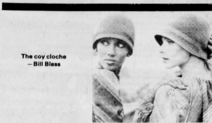
The coy cloche - Bill Blass

The finishing touch of a fine straw hat will be every lady's ticket to a look of cool confidence during this summer's steamy days. A beautiful sampler of the alluring summer straws is waiting to be enjoyed in the June EBONY . The hats come in a variety of striking shapes - from portrait brim to sailor and an array of breathtaking colors - from shimmering yellow to sophisticated black. A good example is the EBONY model's spectacular multi-colored platter accented in silver and gold. This hat will turn a lot of heads as it shields you from the sun's glare. Get set for the sizzling days ahead by accentuating your image with a beautiful summer straw.