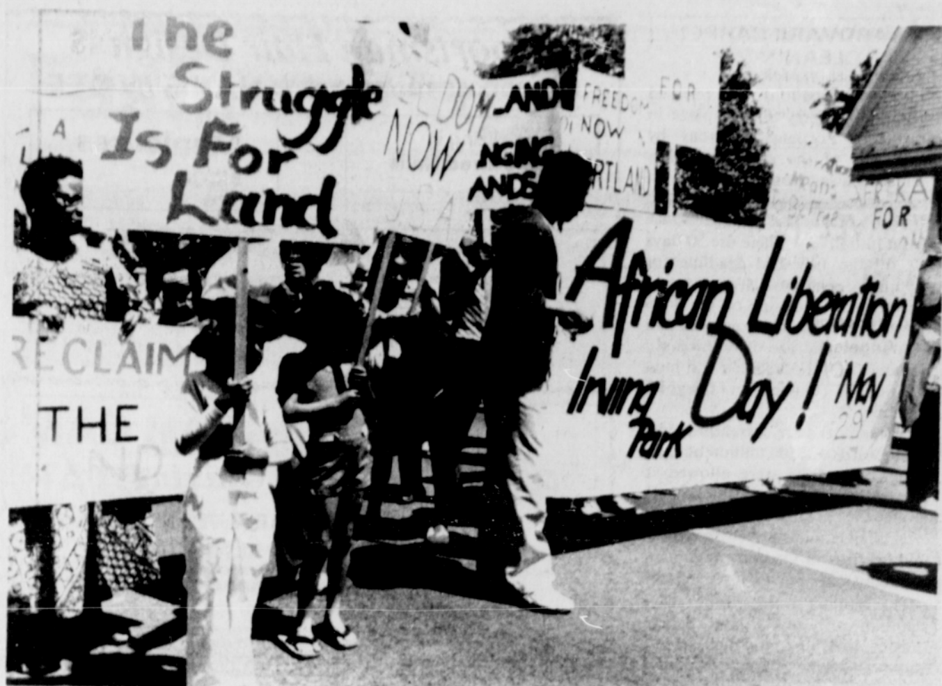
African Liberation Day was celebrated last Saturday with a march and a rally at King Neighborhood Facility.