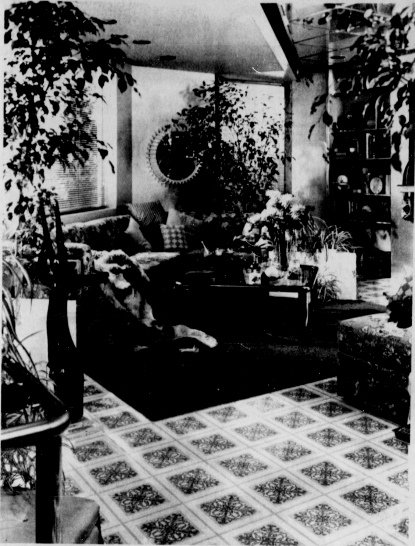
No-wax floors, like this fleur-de-lis on white design collection are now turning up in elegant family rooms, baths and foyers, as well as kitchens.

Increase the resale value of your home with tile. Give it a brand new look that expresses your creativity and lifts your spirits. Tile is an ideal remodeling material. You can achieve dramatic results without tearing down walls or ripping up floors because you can install it over most existing surfaces that are clean and structurally sound. You can even install ceramic tile directly over old tile.