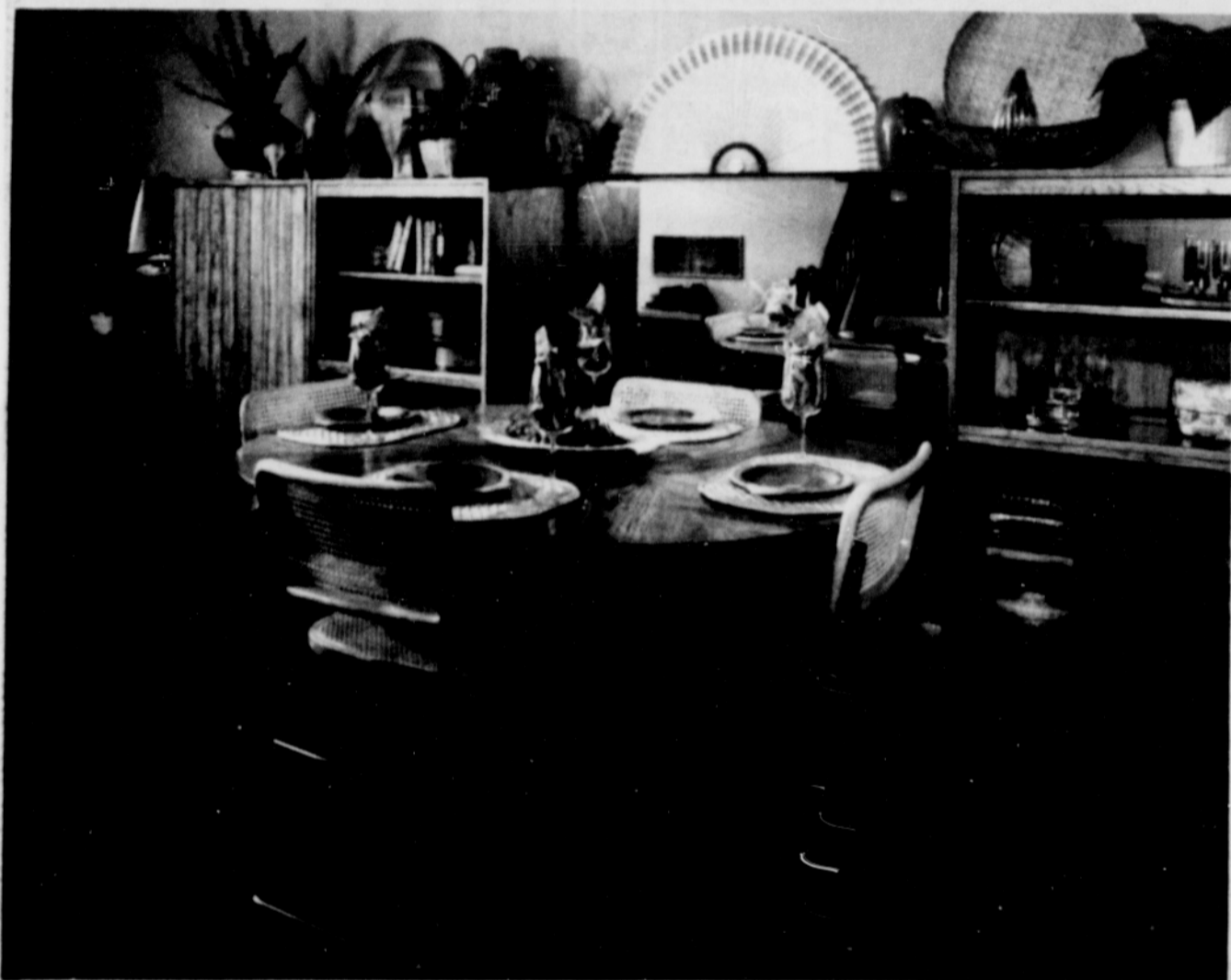
The use of a mirror between two wall units expands and deepens this dining space. Shelving over and across the pieces creates display and storage, and brings eye interest to the upper part of the room.