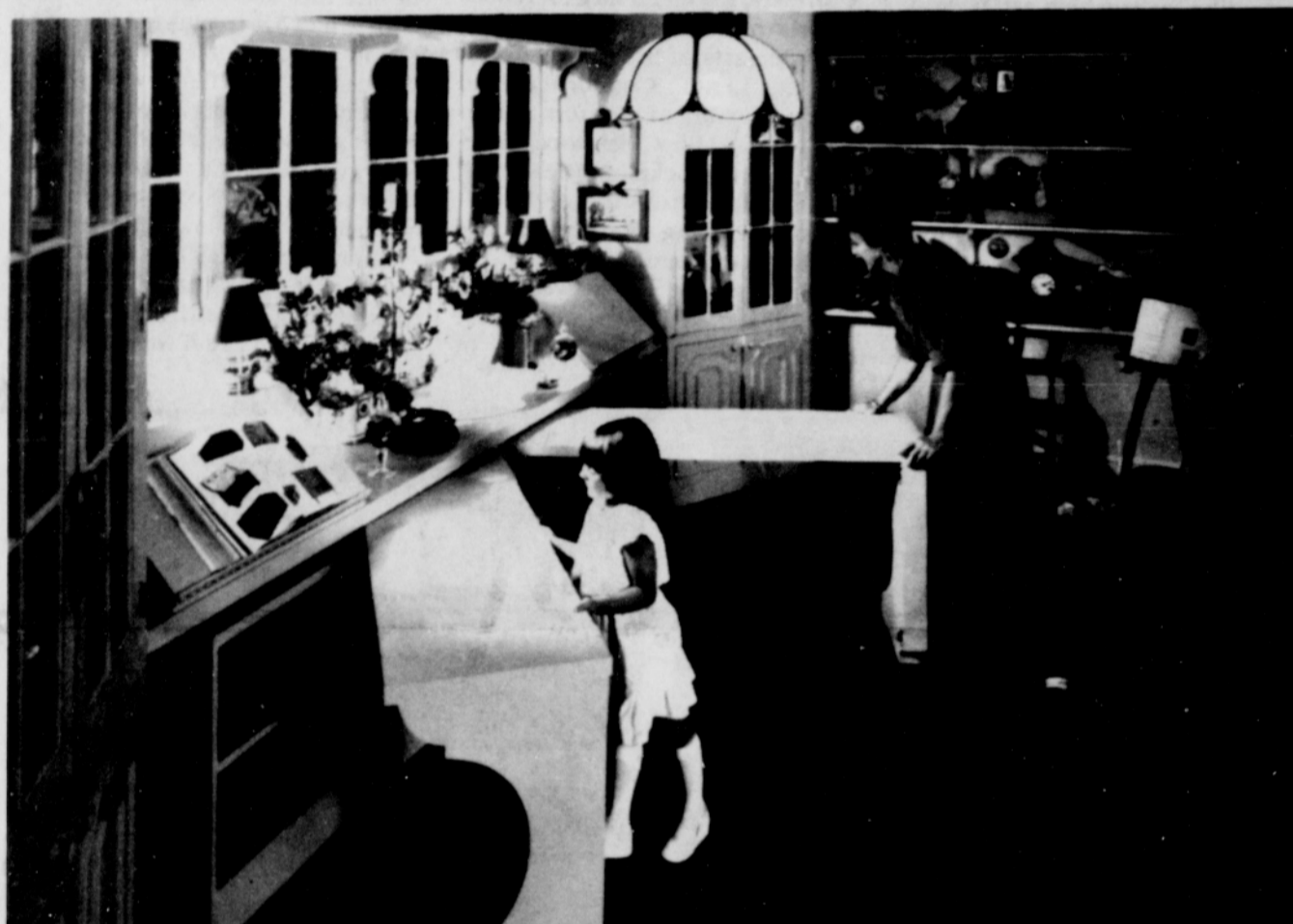
It's a "now you see it, now you don't" dining table. The custom-built "disappearing" table divides and swings under the window where it becomes part of the shelf framework.