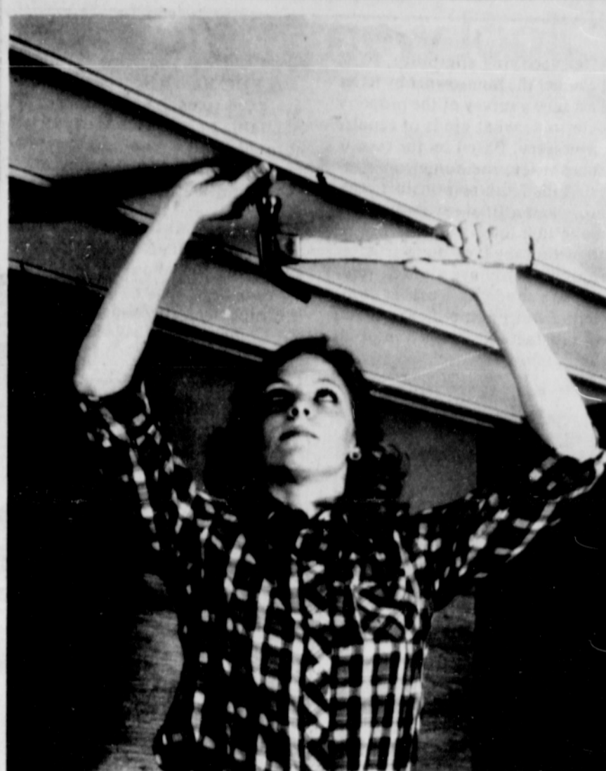
FIRST STEP in putting up a tile ceiling is to nail 4-foot metal tracks to the old ceiling or exposed joists on 12-inch centers. The easy-handling tracks replace unwieldy, warp-prone wood furring strips often used to put up ceiling tile.