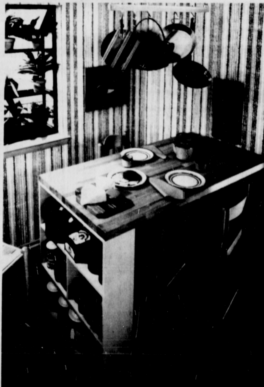
In the tiniest area available, it is possible to create storage, style, and provide adequate dining space in a model-home kitchen.