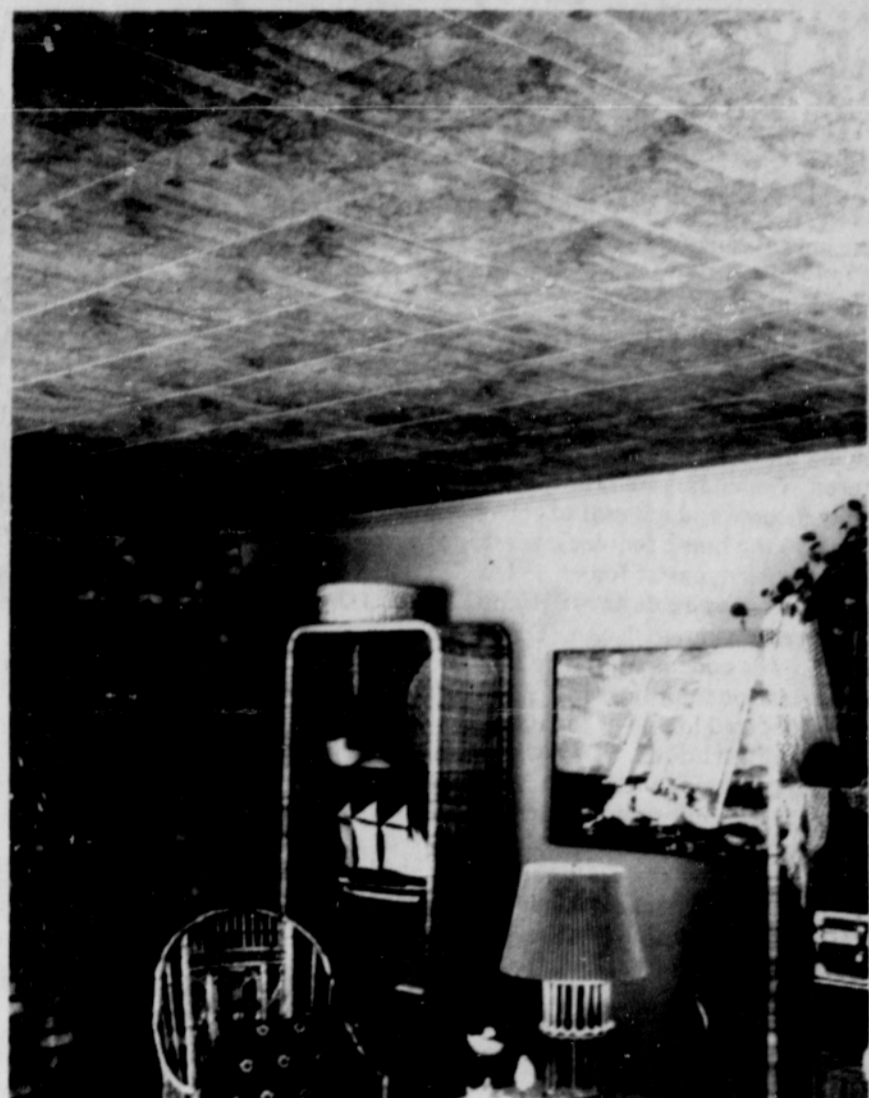
FINISHED CEILING required no stapling, no adhesive and less than half the nailing of a tile ceiling installed with conventional wood furring strips.