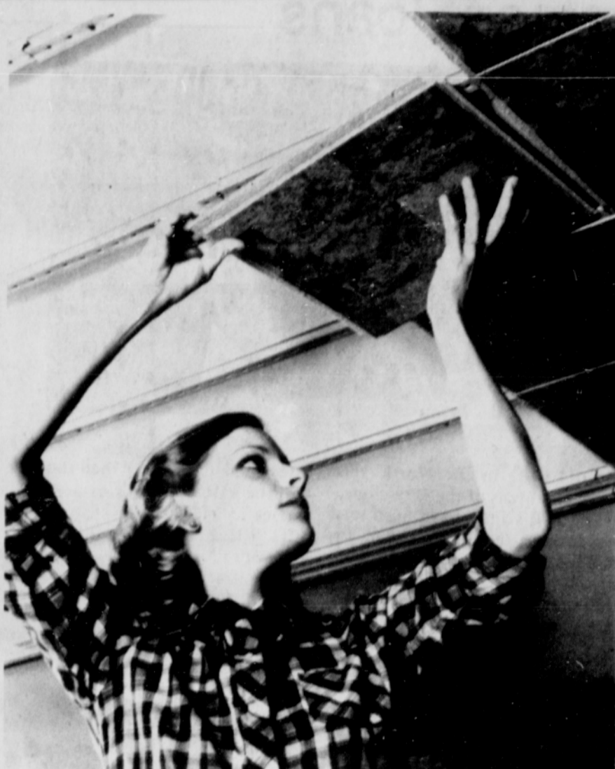
SECOND STEP is to position the ceiling tile flush against the track. Any standard tile or plank (an oblong tile) can be installed using this new method.