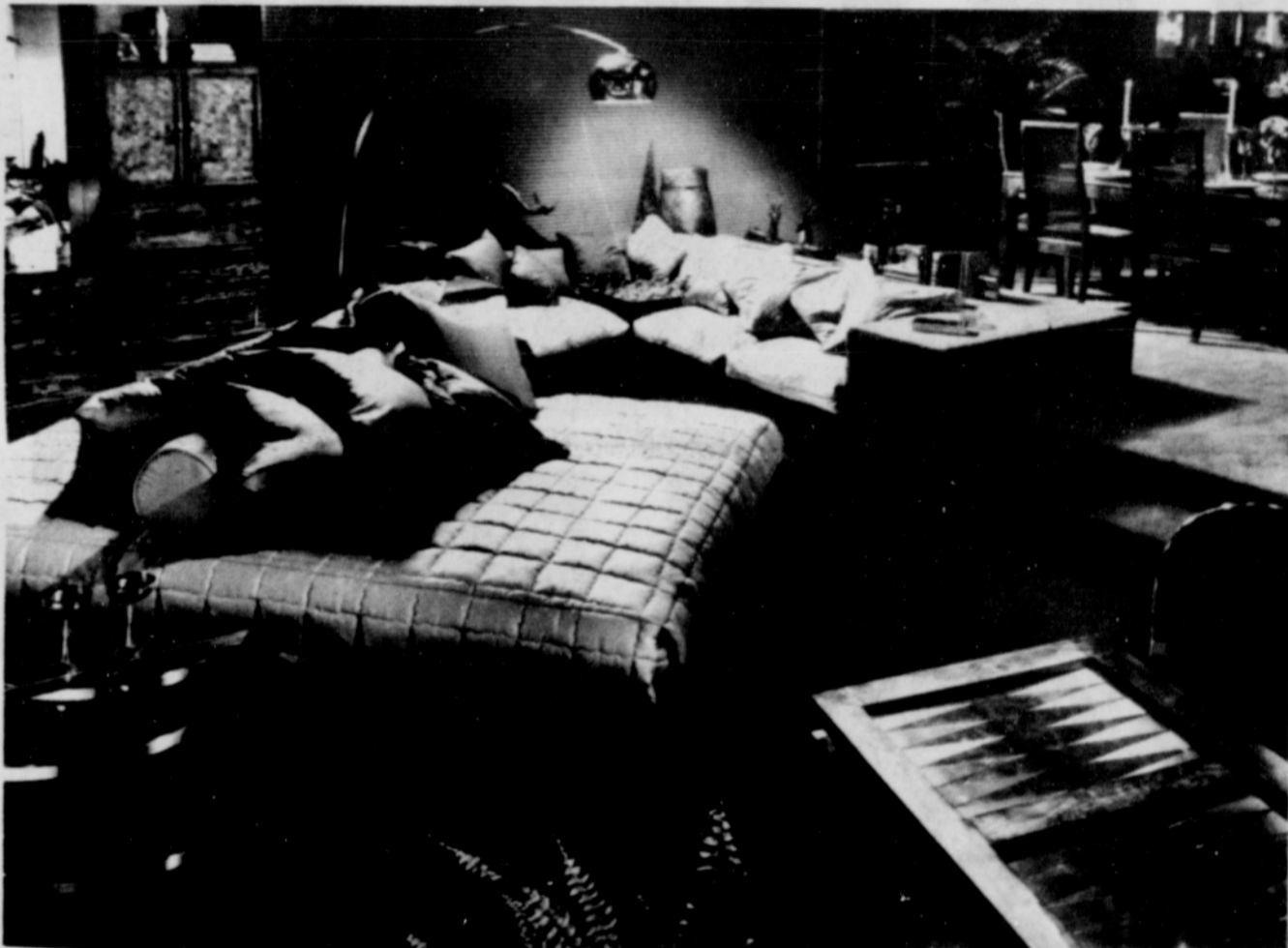
One room is home for many. But one room doesn't have to be limited to four walls, a floor, ceiling, and a hodge-podge of furniture.

Featuring ash solids and veneers, the light toffee finish brings out the very best of the wood's grain-