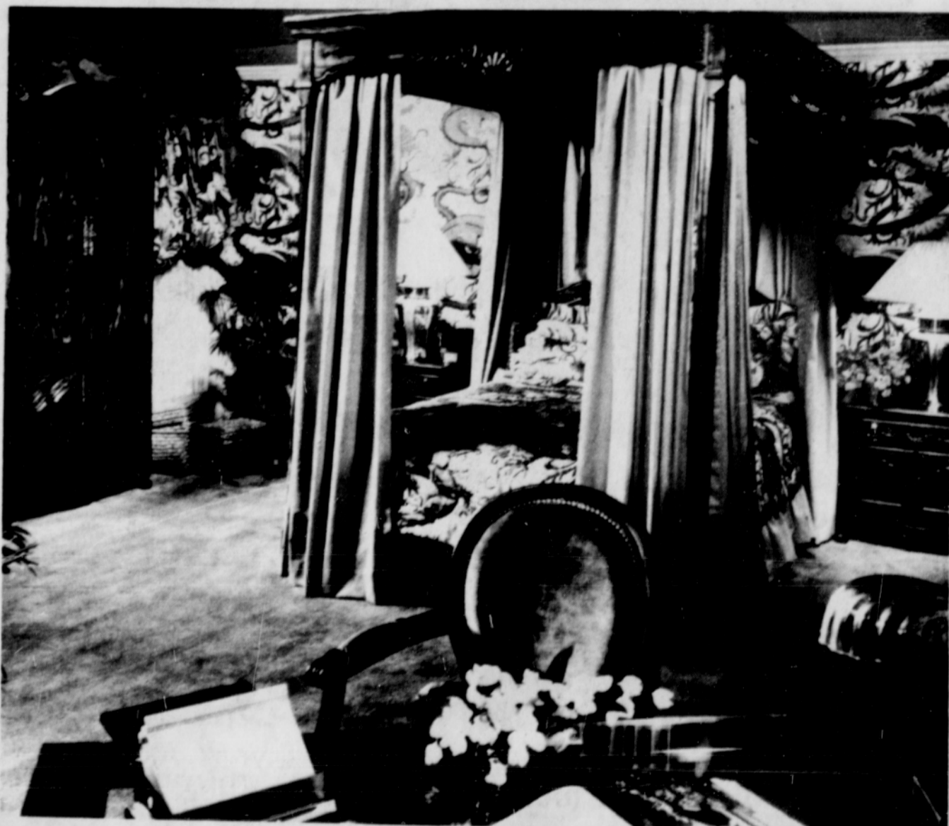
This bedroom retreat illustrates the sophistication of mixing a Camille canopy bed, armoire and night tables with contemporary brass-and-glass and oriental-inspired wallcovering and fabric.

the room takes on larger proportions, helped along by plushy wall-to-wall carpets.