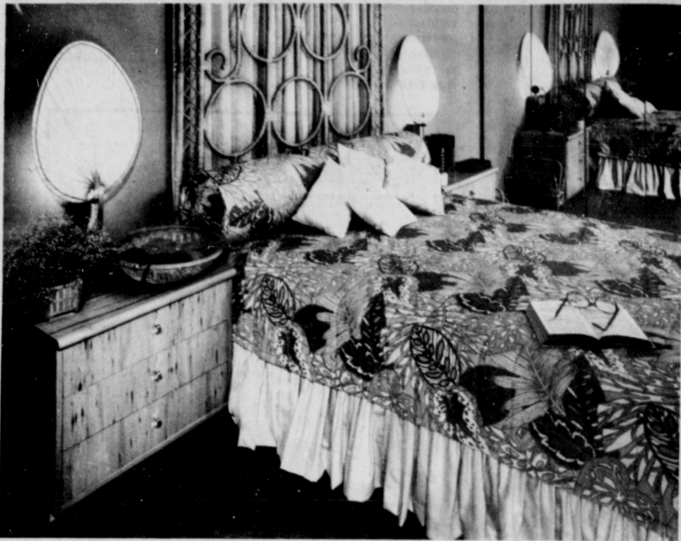
A tiny guest room appears gargantuan through the use of "mirror magic." Floor-to-ceiling mirrored closet doors visually extend the room be-

yond its real dimensions. Wall-to-wall carpet aids the illusion by pushing floors out to the walls, helping to create the appearance of a much larger room.