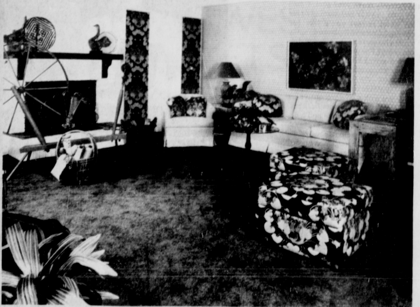
An excellent example of how to get a lot of decorator dollar-value out of a few yards of patterned fabric is illustrated.