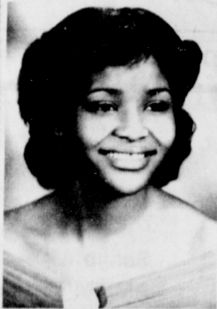
PRINCESS TAY RANETTE