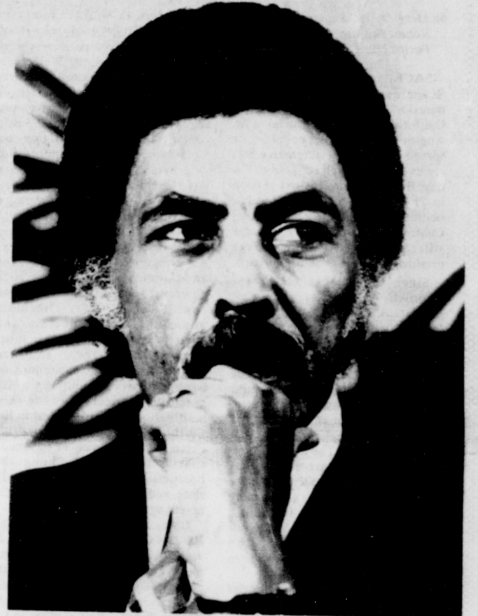
CONGRESSMAN RON DELLUMS

Dellums' first priority upon entering Congress in 1970 was ending the war in Indochina, which he characterized as "illegal, immoral and insane adventurism." His major goal still remains the termination of the United States' all-too-ready reliance on brutality and force to accomplish diplomatic and economic objectives. He believes that militarism, the mentality that is so afraid of life that it seeks to control it through death and destruction, is the fundamental cause of social and economic failures