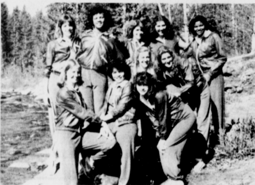
Group photo of the princesses on an outing.

The present day festival is building up momentum. The date of the 1982 Queen Selection and Coronation is slated for Friday, June 4 in the Civic Auditorium at 8 p.m. and the mystery of it all will fulfill one princess' fantasy of being crowned the new Queen of Rosaria—her reign to be one year. Closure of two high schools in the Portland Public School District reduces the 1982 court to eleven princesses. The Cinderella Syndrome begins with pampering from head to toe.