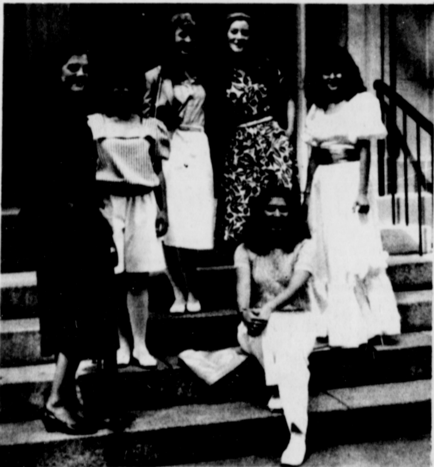
Informal gathering highlights some of the outfits including coronation dress (far right).