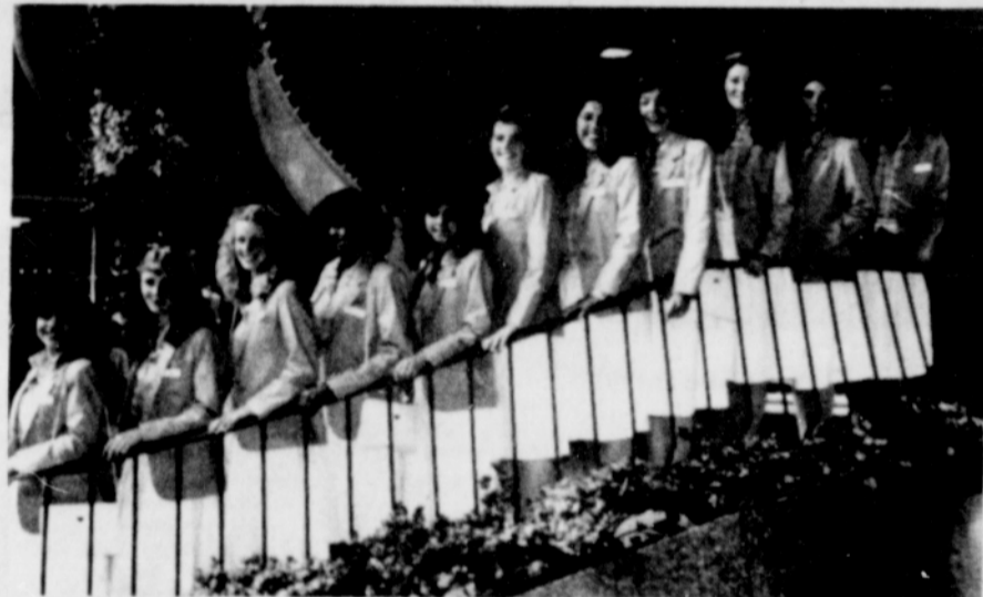
Princesses line up at Lloyd Center.

A Rosarian, with a Benson driver, will pick up each princess at her home in a beautiful new Pontiac and return her at the end of the day's activities during Rose Festival Week. Prior to Rose Festival activities, parents must accompany their princess to the starting point and transport them home daily. Court protocol is tight—rules and guidelines are set by the Rose Festival Directors—as the community watches—no smoking, no drinking, sunglasses permitted only for certain occasions, no excessive jewelry—and most important—they must always be ready according to schedule, so that no one is kept waiting. Parents' involvement varies according to their schedule. Usually parents receive invitations to attend various civic club meetings, such as Portland Chamber of Commerce, Kiwanis Luncheon, etc., on a no-host basis.