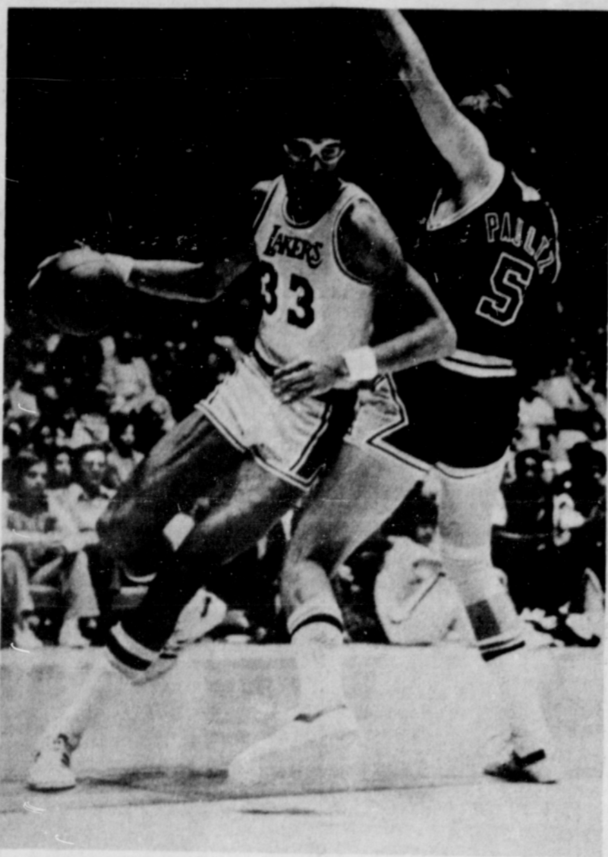
Kareem: Can he sink the Sixers?

My! I just forgot its only a game (smile). Philly in six.