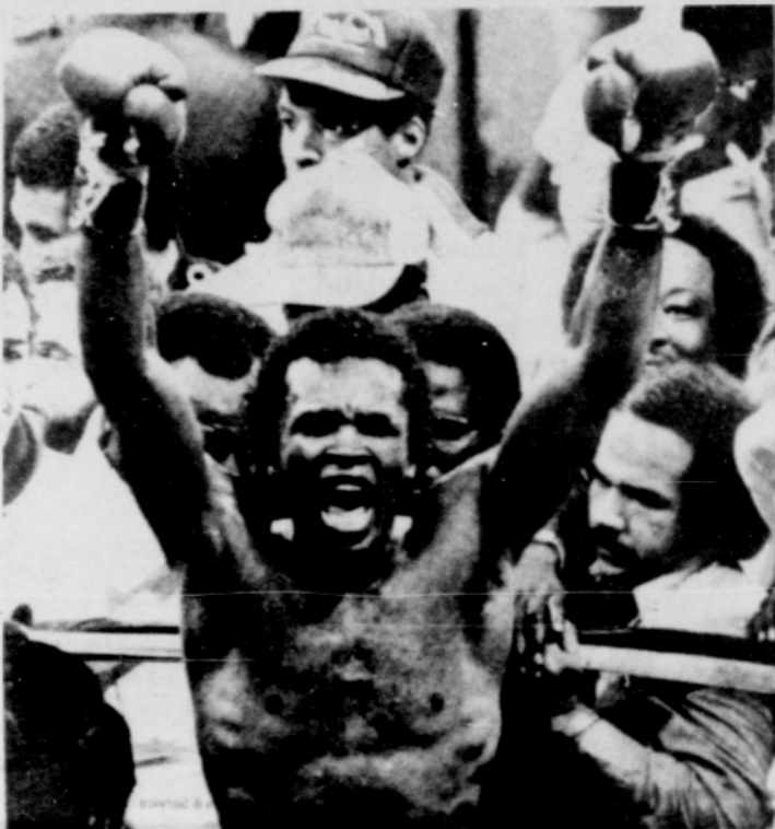
Sugar Ray: Victorious over Hearns