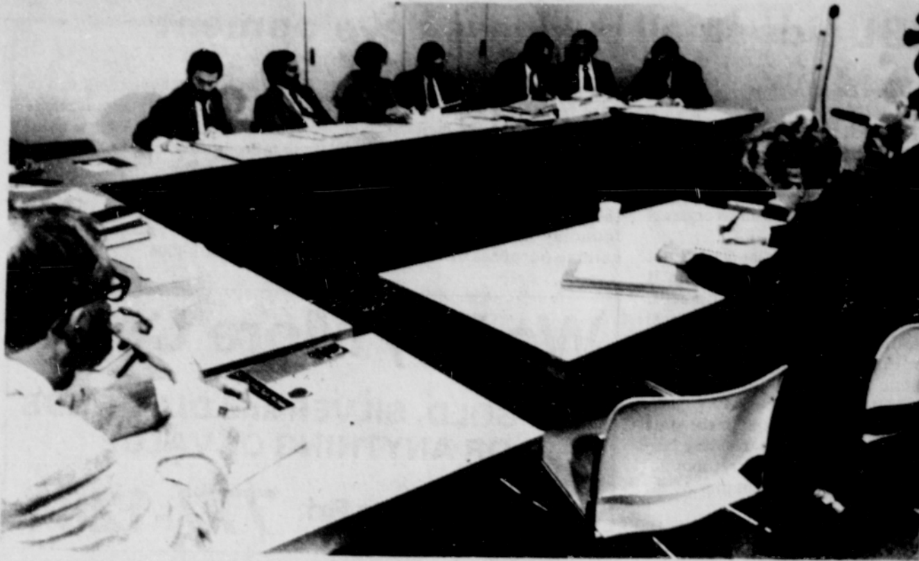
School Board members privately consider important issues under garrison conditions while demonstrators and the public wait below.