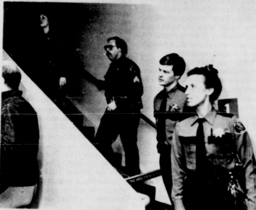
School police guard straining to keep public from cloistered School Board meeting.

The Portland School Board escaped Black United Front demonstrators by retiring to a small cafeteria and excluding the public. The BUF is protesting the siting of Tubman Middle School in the Boise building, which breaks an earlier commitment to place it at Eliot. Please see stories on pages 1 and 3.