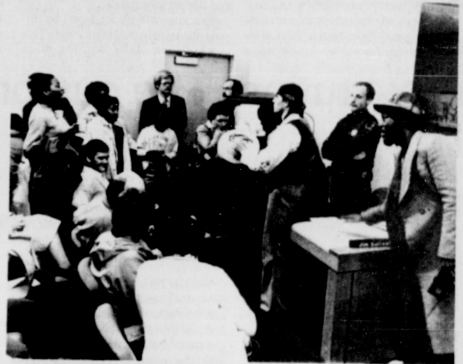
Demonstrators chant to drum beat of Brave Bear while spectators listen to Board Meeting on closed circuit T.V.

The Portland School Board escaped Black United Front demonstrators by retiring to a small cafeteria and excluding the public. The BUF is protesting the siting of Tubman Middle School in the Boise building, which breaks an earlier commitment to place it at Eliot. Please see stories on pages 1 and 3.