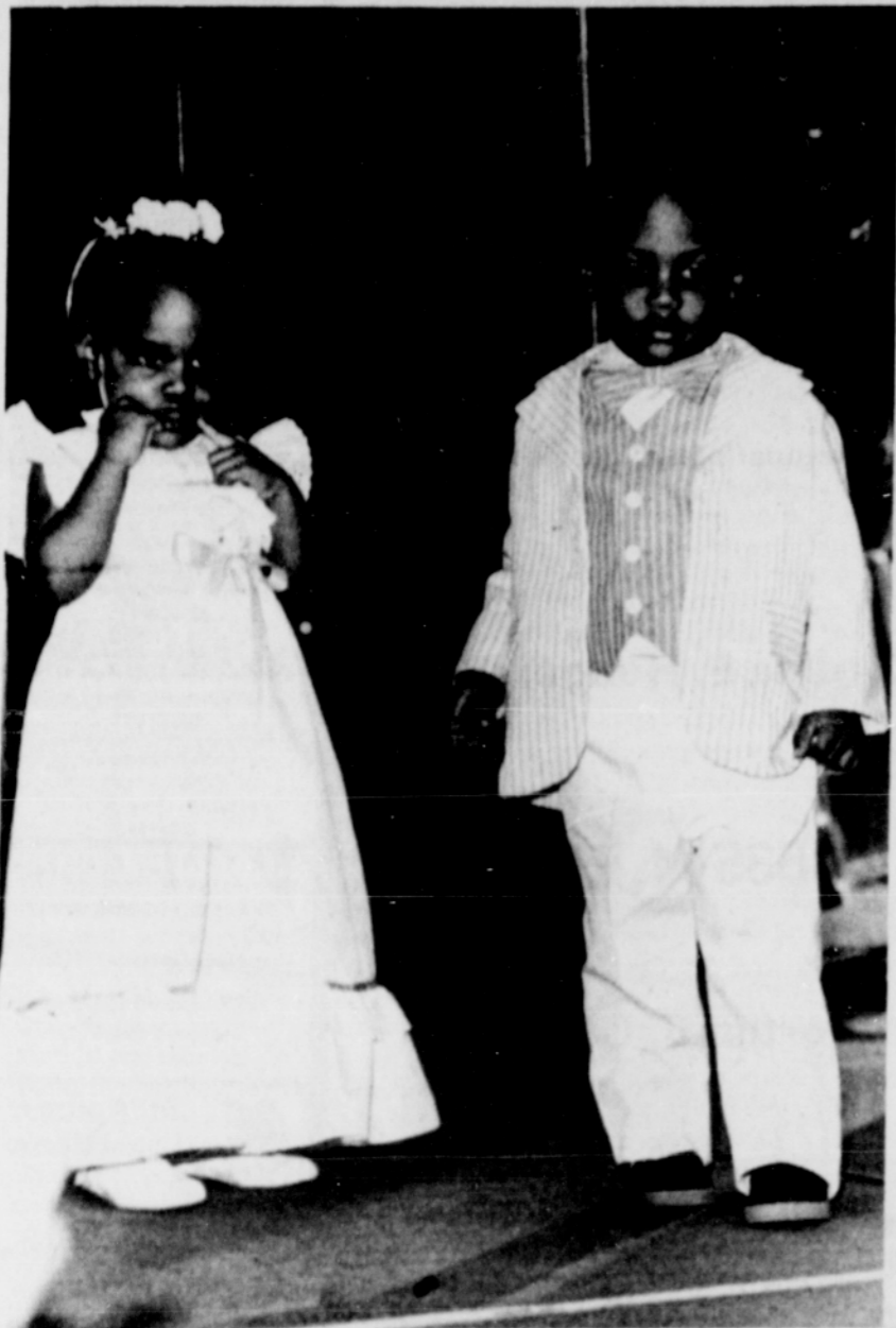
Children of Allen Temple AME Church make their new Easter clothing at recent fashion show.