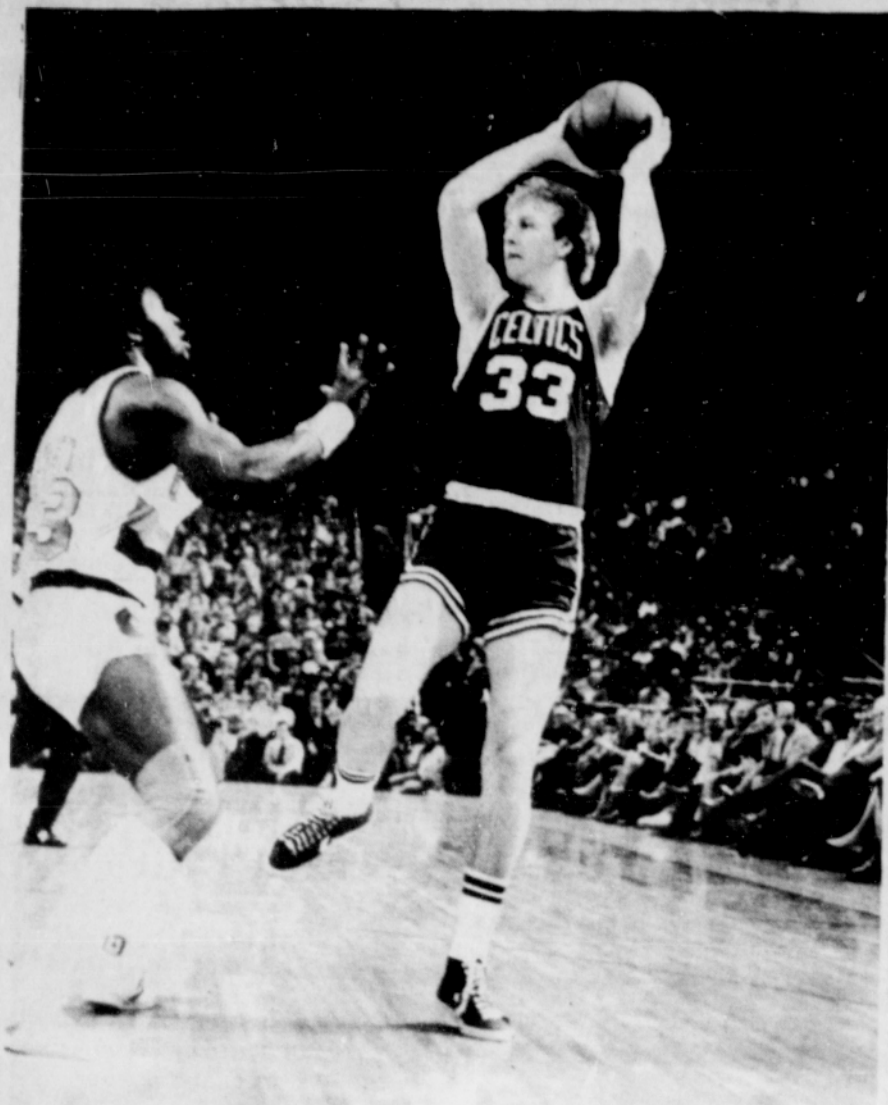
Celtic forward Larry Bird stands ready to hit the open man in Boston's win over Portland. Certainly a valuable asset to the team. Bird scored 25 points as Boston toppled Portland 127-117.