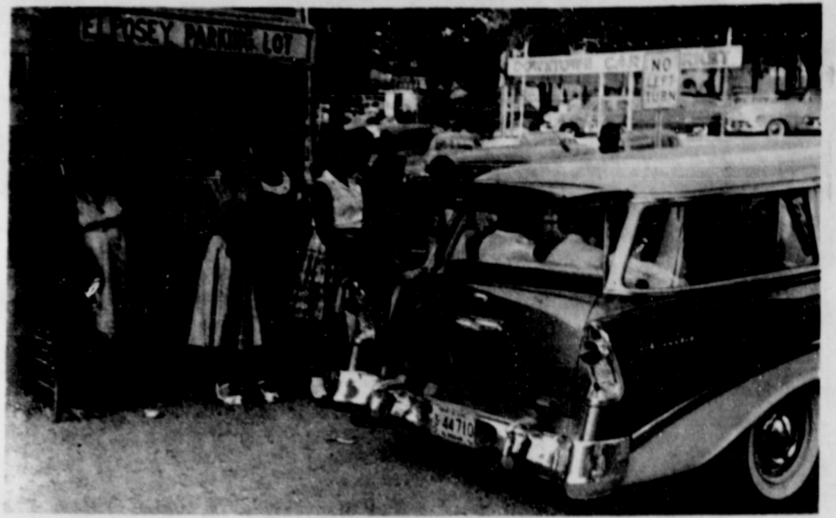
Car pools were an effective means of getting to work; many walked.