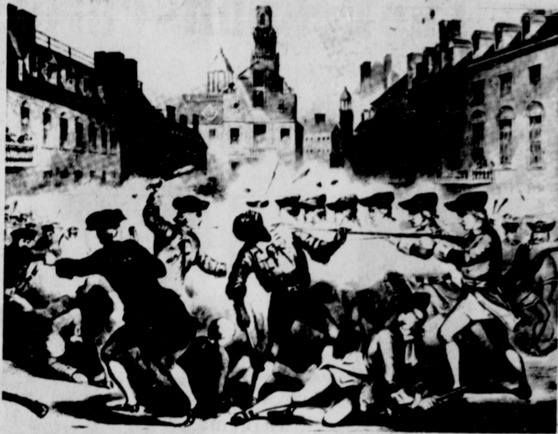
Boston Common: Crispus Attucks, a runaway slave, in 1770 became the first to die in American Revolution

1895. On that occasion Washington urged members of his race to "cast down their buckets" among the friendly white Southern people and to share the common purpose of raising the South's economic level. He offered the white South a peaceful reservoir of Black labor for the burgeoning southern industries.