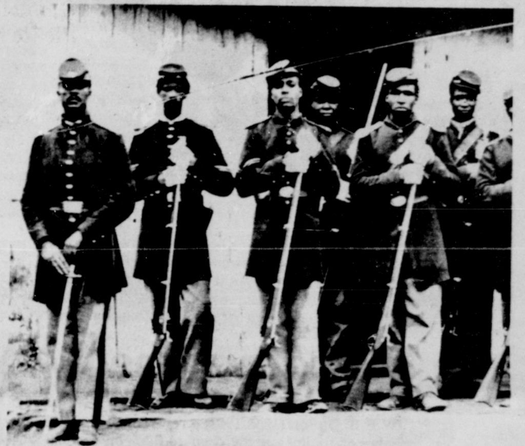
Black soldiers fought bravely in the Civil War.

One-fifth of America's frontier cavalrymen were Black. Frederic Remington sketched one trooper conversing in sign language with an Indian in 1880s.