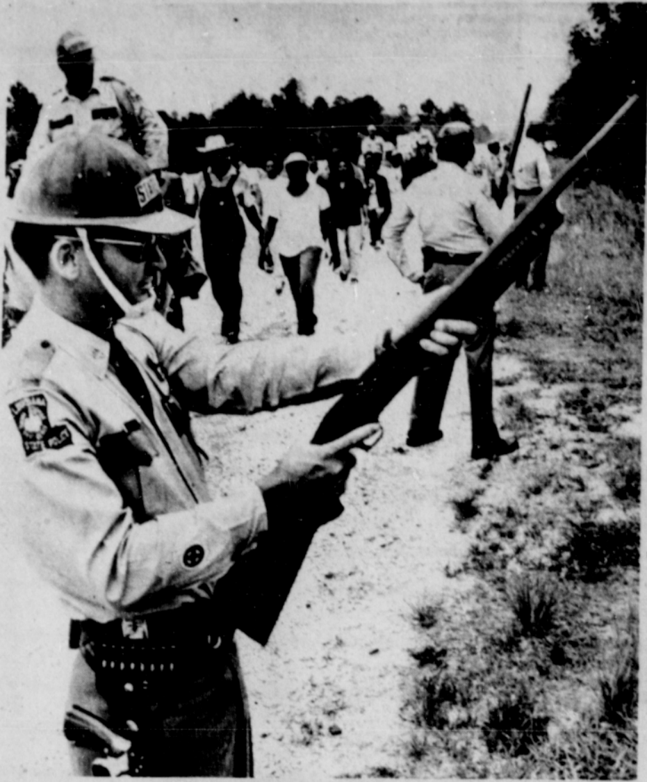
On the way to Baton Rouge