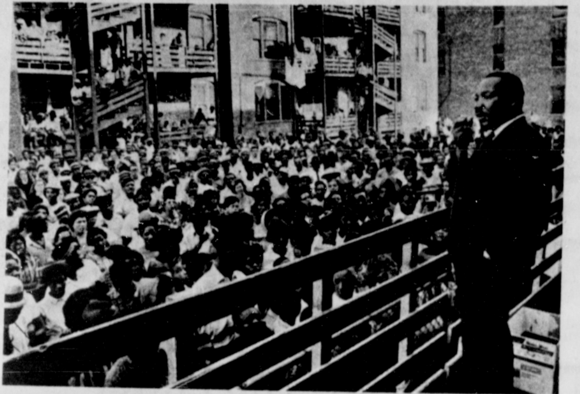
In the Chicago stockyards.