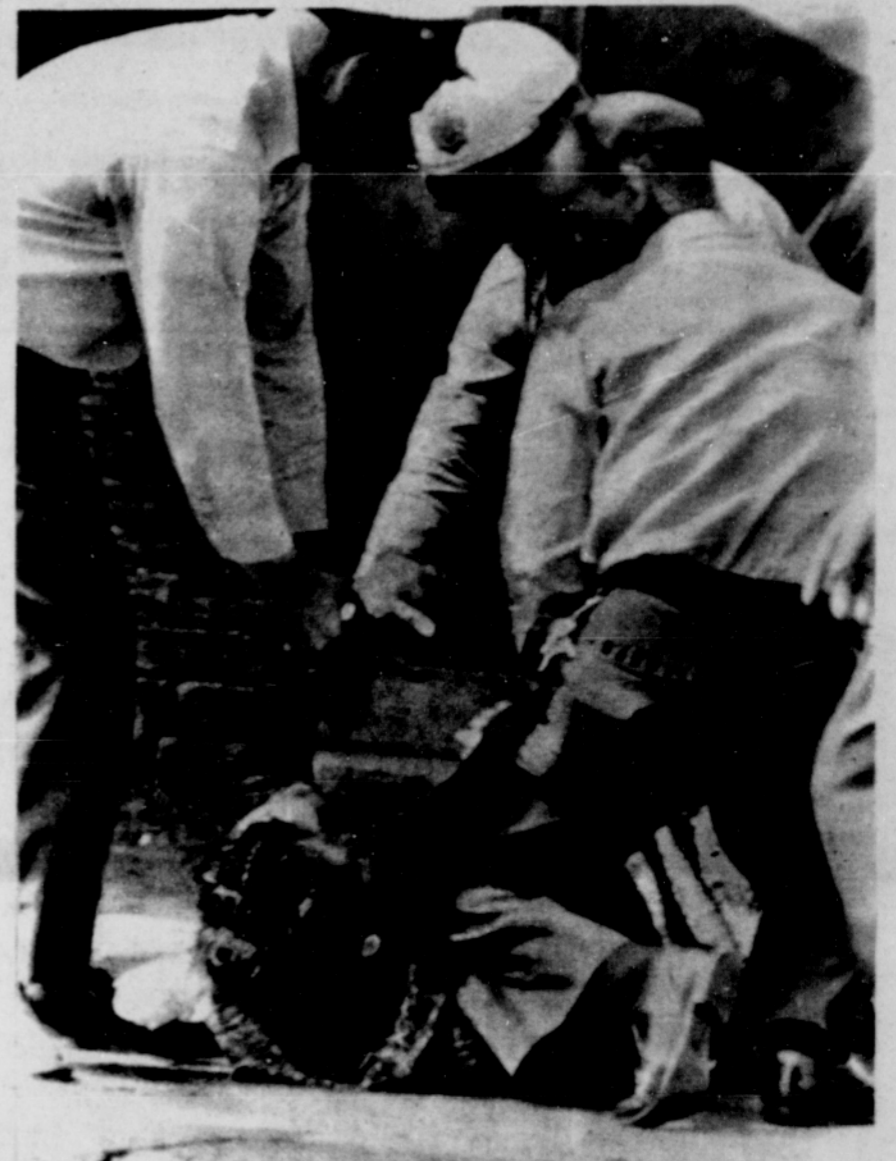
More than 2,000 demonstrators were arrested in the Birmingham anti-segregation campaign. Police used fire hoses and dogs on marching children.

"We know through painful experience that freedom is never voluntarily given by the oppressor; it must be demanded by the oppressed."