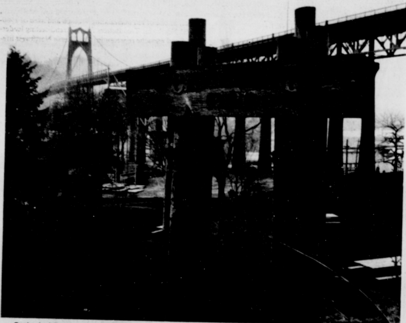
Cathedral Park, located under the ramps of the St. Johns Bridge, adjacent to the Willamette River, is the result of years of community organizing and planning