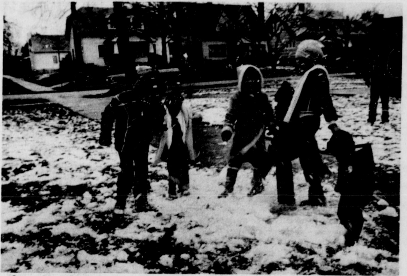
Snowy days in Portland: school children have a day off to play in the snow.

The primary purpose of the week of affirmation is to educate the public about various forms of racial and religious harassment occurring in our community and to encourage citizens to make a personal commitment to recognize and support the variety of ethnic, religious and racial groups that make up and enrich our society.