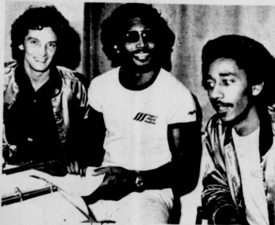
Big Tour Set