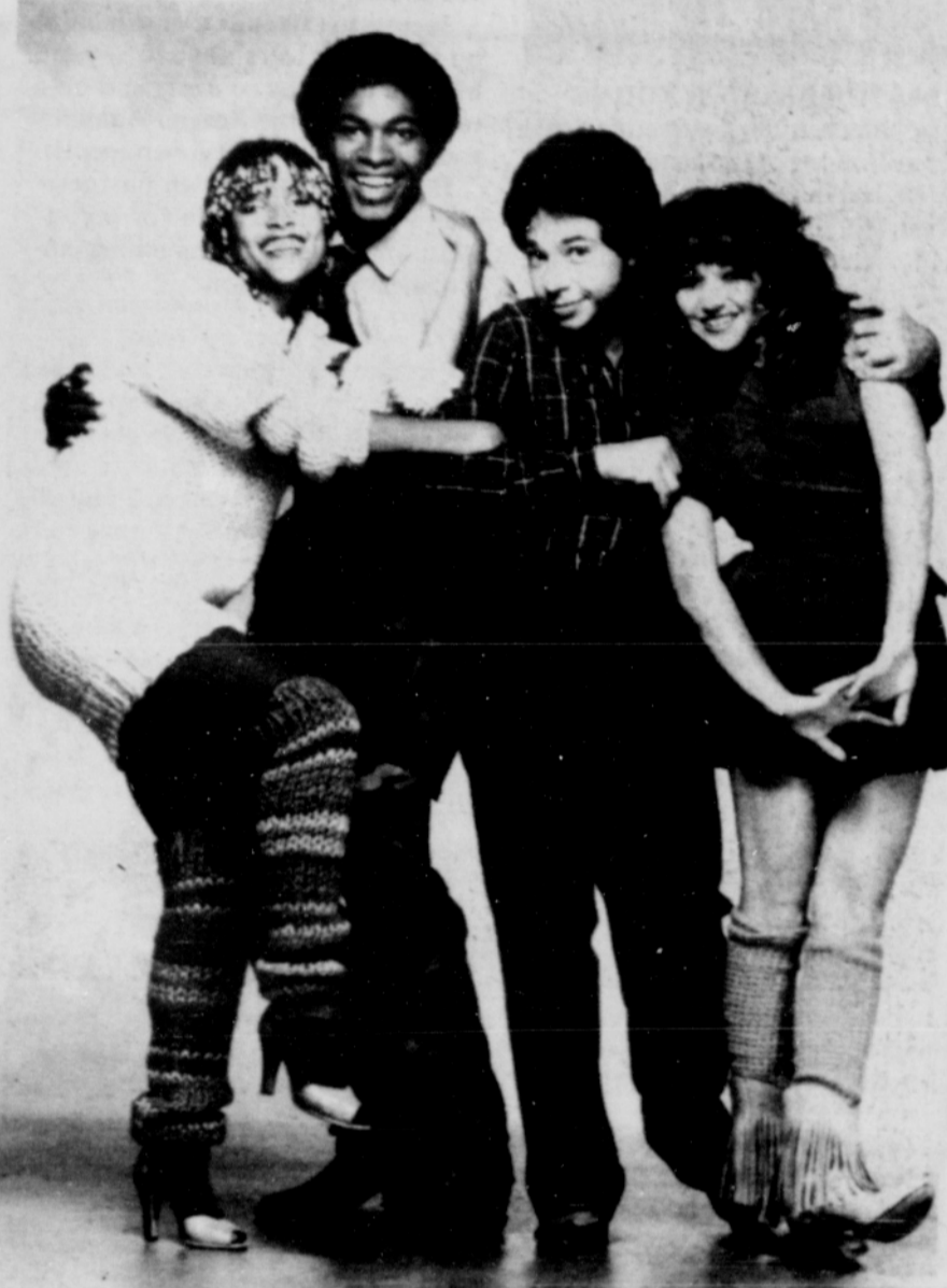
The Righteous Apples

What gives The Righteous Apples believability is its realization that life is not as simple as black and white. The characters, from kids to parents, whatever their race, all have opinions about things—as individuals. They give us the shades of gray. Instead of wrapping up each show in a neat, little, ribbon-tied package, the endings are often left open-ended so the audience can draw their own conclusions. The Righteous Apples , unlike many television programs, gives the viewer credit for having some intelligence. In an episode about inter-racial gang violence, a white youth is killed and a Black, crippled for life. The ending has both sides still angry, still confused. There are no handshakes and smiles—but the message is obvious. Fighting