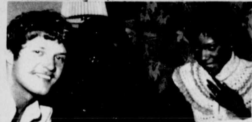
Butch Coors at a recent Studio One party with Melba Moore, Sylvester in Los Angeles

1405 N.E. Broadway, Portland, Oregon 97212