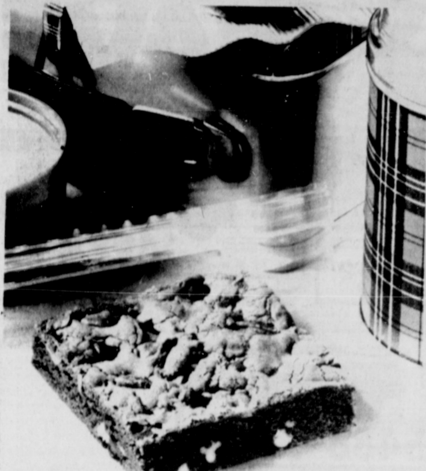
Double Fudge Brownies make delicious dessert for school lunches.