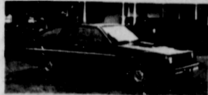
There are all kinds of good things to be said about 4-door cars, but