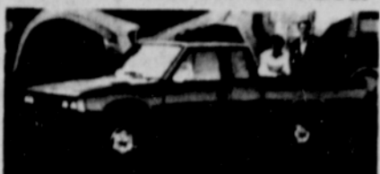
Hatchback Sedan comes with more power than ever before to go with the superb handling of front-wheel drive. It also comes with a new 5-speed overdrive transaxle that saves gas in a big way, and plenty of room for four grown-up adults.