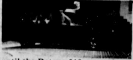
until the Datsun 310 came along sporting performance wasn't one of them.