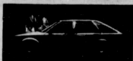
This care changes all that forever. The 1982 Datsun 310 GX 4-Door