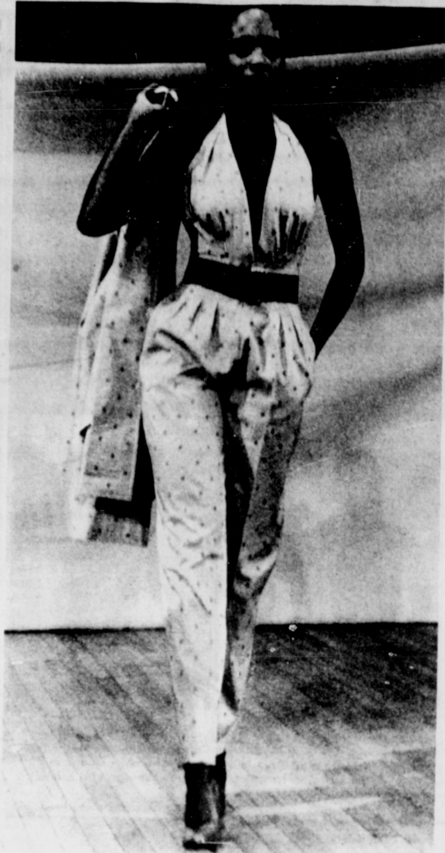
Getting The Jump On Dots! More party time fun, this time it's Willi Smith's "Katy Keene" jumpsuit (remember the comic book heroine of the '50s who simply adored clothes). You'll simply adore the bare halter neckline, not-too-narrow pleated pants and the waist focused with a shiny patent belt. Cotton poplin color combinations of brown with yellow, beige with blue or grey with red.