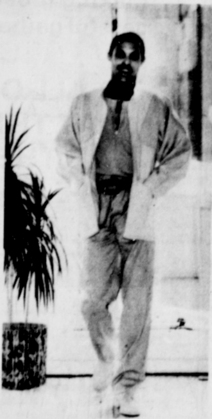
Cream wool gabardine zip front T-shirt with matching gabardine pants feature elastic waist. Slashed buttonhole pockets and fake fly are held together with cowhide belt.