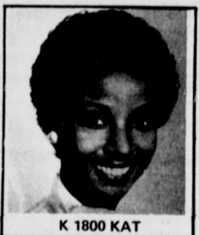
K 1800 KAT