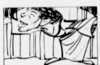
The African Company performed Shakespeare in a theater on New York's Mercer Street in 1821.