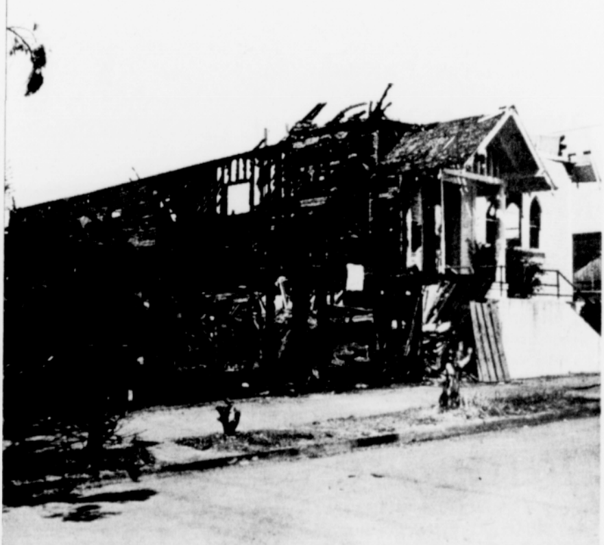
Providence Baptist Church and an apartment building on Failing and Garfield were burned as a result of arson. Anyone seeing any cars or people in the area at around 4:00 a.m., Friday are asked to call the arson department, 248-4363.