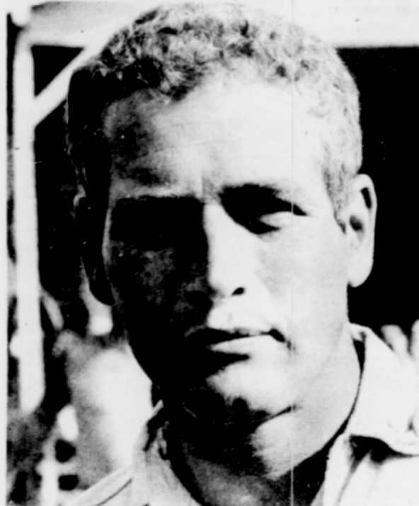
"Cool Hand Luke" starring Paul Newman.

Crime buffs will relish The Taking of Pelham 1-2-3 , described by the New York Daily News as a "hijack thriller, tense, exciting, and laced with natural humor." Four ruthless marauders take over a New York subway car, threatening to kill a hostage every minute if a million dollars isn't delivered in time from the mayor's office. Walter Mattau portrays a transit cop determined to bypass city bureaucracy and foil the scheme on his own. But when the train breaks loose without a conductor and catapults full speed toward South Ferry, everyone involved is taken off guard.