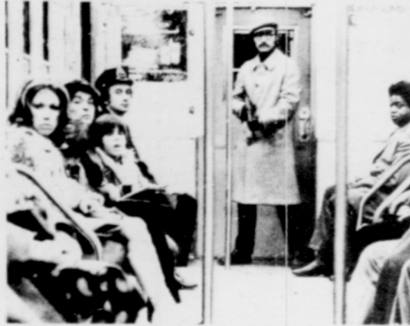
A scene from "The Taking of Pelham One, Two, Three."

Among the Great May Movies are examples of comedy and suspense, fantasy and romance, spanning the frontier and Fifth Avenue. From the following samples there is sure to be a selection that will fit most any taste.