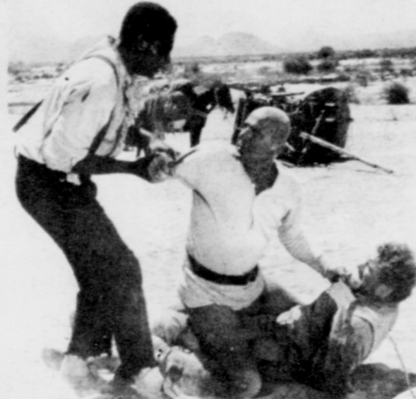
Ossie Davis, Telly Savalas and Burt Lancaster in "The Scalphunters."

must constantly prove himself to brutal overseers and his own fellow prisoners, whose fiercely competitive leader is played by George Kennedy. (His depiction of the raw gang boss won Kennedy an Oscar). There are many ways Luke meets the pressure to prove his mettle, and one of the film's most memorable scenes has Luke betting he can eat 50 hard-boiled eggs in an hour. Yet few of Luke's trials are so light, and eventually he has to stake everything he is for the sake of survival.