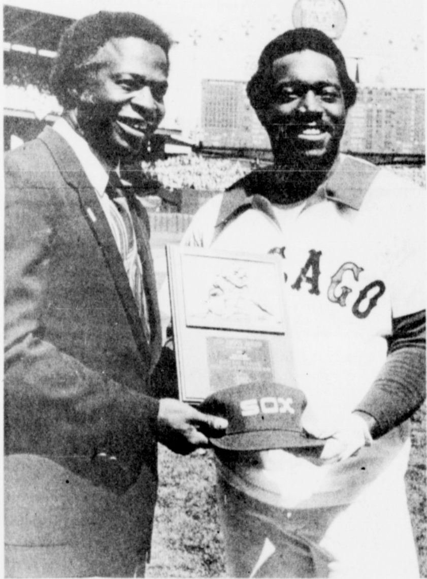
Baseball great Lou Brock presents Chicago White Sox outfielder Ron LeFlore with the Lou Brock Award during opening day ceremonies at Comiskey Park. The award is presented annually to the National League base stealing champion. LeFlore stole 97 bases while playing for the Montreal Expos last season. Brock, a former St. Louis Cardinal, is baseball's greatest base stealer both for a single season (118) and for a career (938).

But as always, this is just one Black man's opinion.