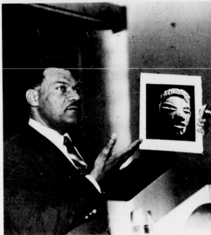
Dr. Ivan Van Sertima shows ancient African art.

He goes on to discuss his book and the long-term effects on history. "There will be great fights over it,