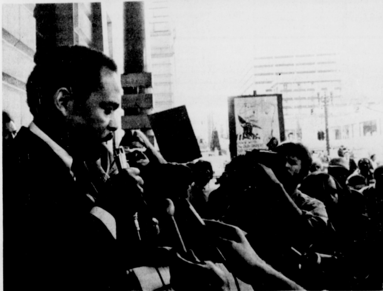
March proceeded through the city to City Hall.