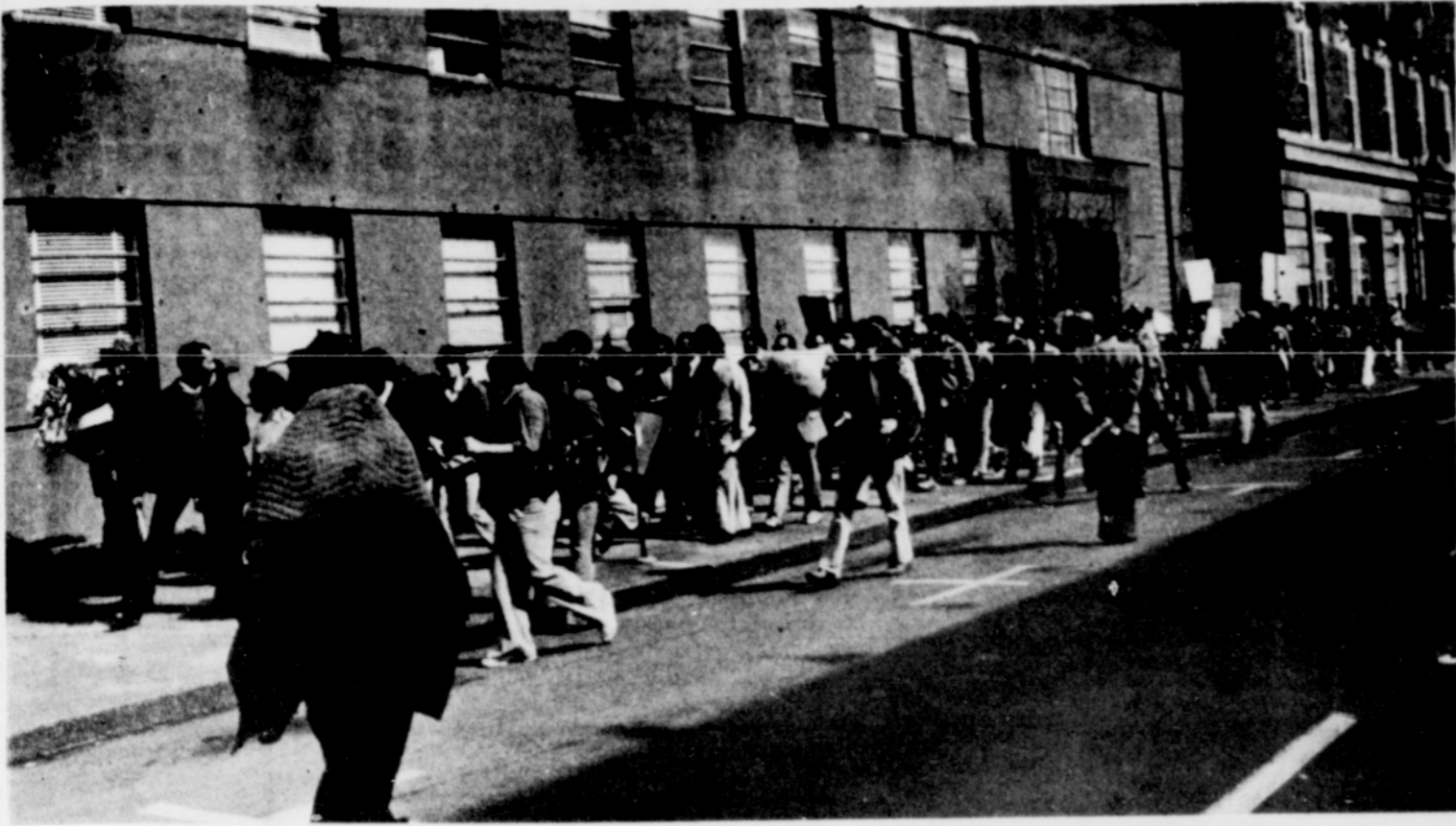
Picket of Portland Police Bureau protests police brutality and harassment.