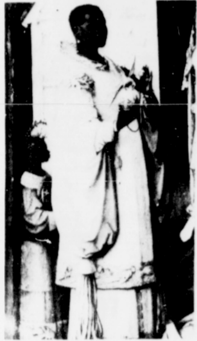
This depiction of a Black King Balthasar, one of the three Wise Men, is a detail from "Adoration of the Magi," painted by Hieronymus Bosch between 1490 and 1510 A.D.