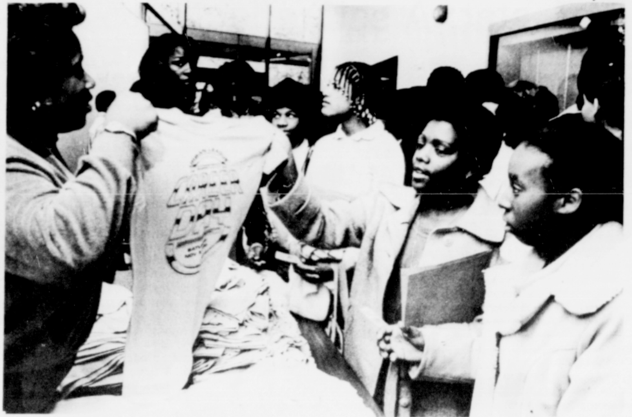
Everyone received a "Career Day" T-shirt.