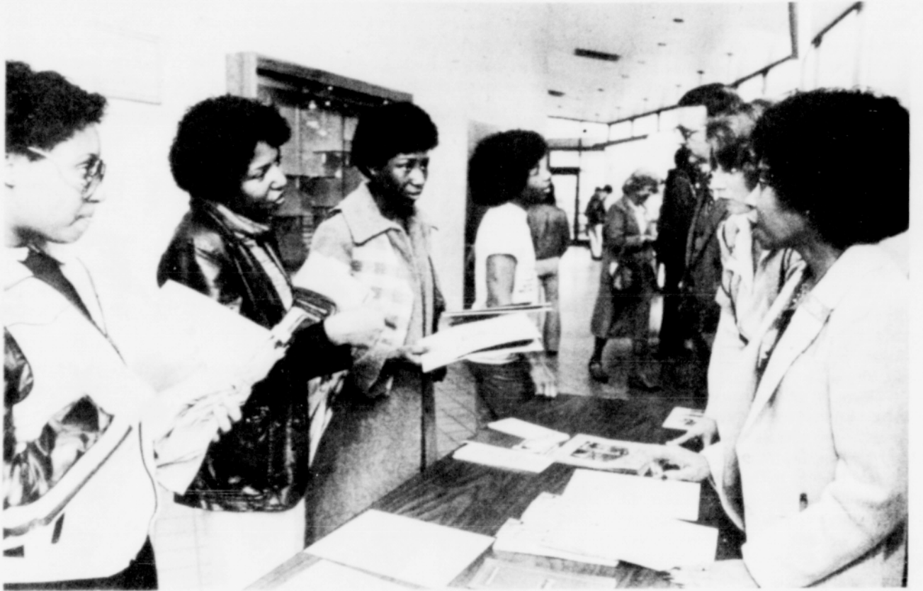
High school students register for Career Day.

The Urban League is the prime sponsor of the Career Awareness Day along with fundings from private companies; some participating in the program. The program is planned yearly, one month after the previous Career