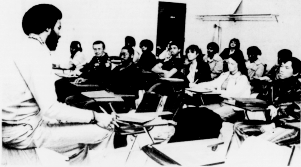
Seminars were conducted to give students information on opportunities and requirements of various careers.