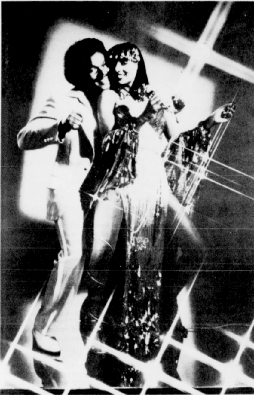
America's Couple of the Year, Peaches & Herb, will soon be appearing in stores around the world, in the form of a 20x28 inch, full-color poster. The duo has made music history with chart busters, like Reunited, Shake Your Groove Thing, I Pledge My Love, and their newest single, Funtime.