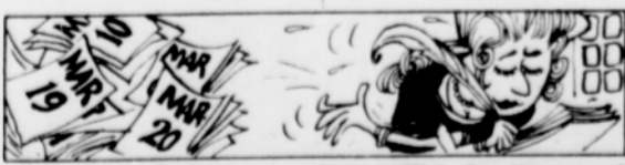
Madame de Sevigne, sometimes called the "queen of letter writers," wrote to her daughter almost daily for 25 years after she married and moved from Paris in 1668.