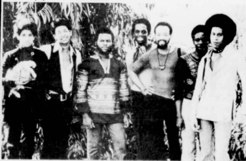
EARTH, WIND & FIRE

She is, in the words of one critic, "a commanding singer with something to say," and has been called by the New York Times "perhaps the best unknown pop star in the business."